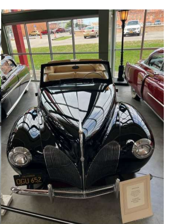
1953 Caddy Coupe Deville