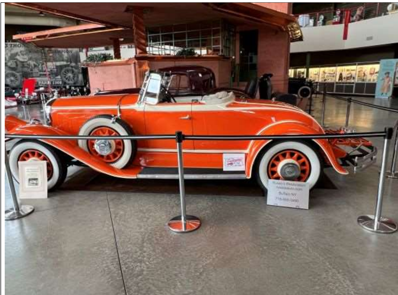
Note the Gas Station the background

The Gas Station is a Frank Lloyd Wright design and was never built.