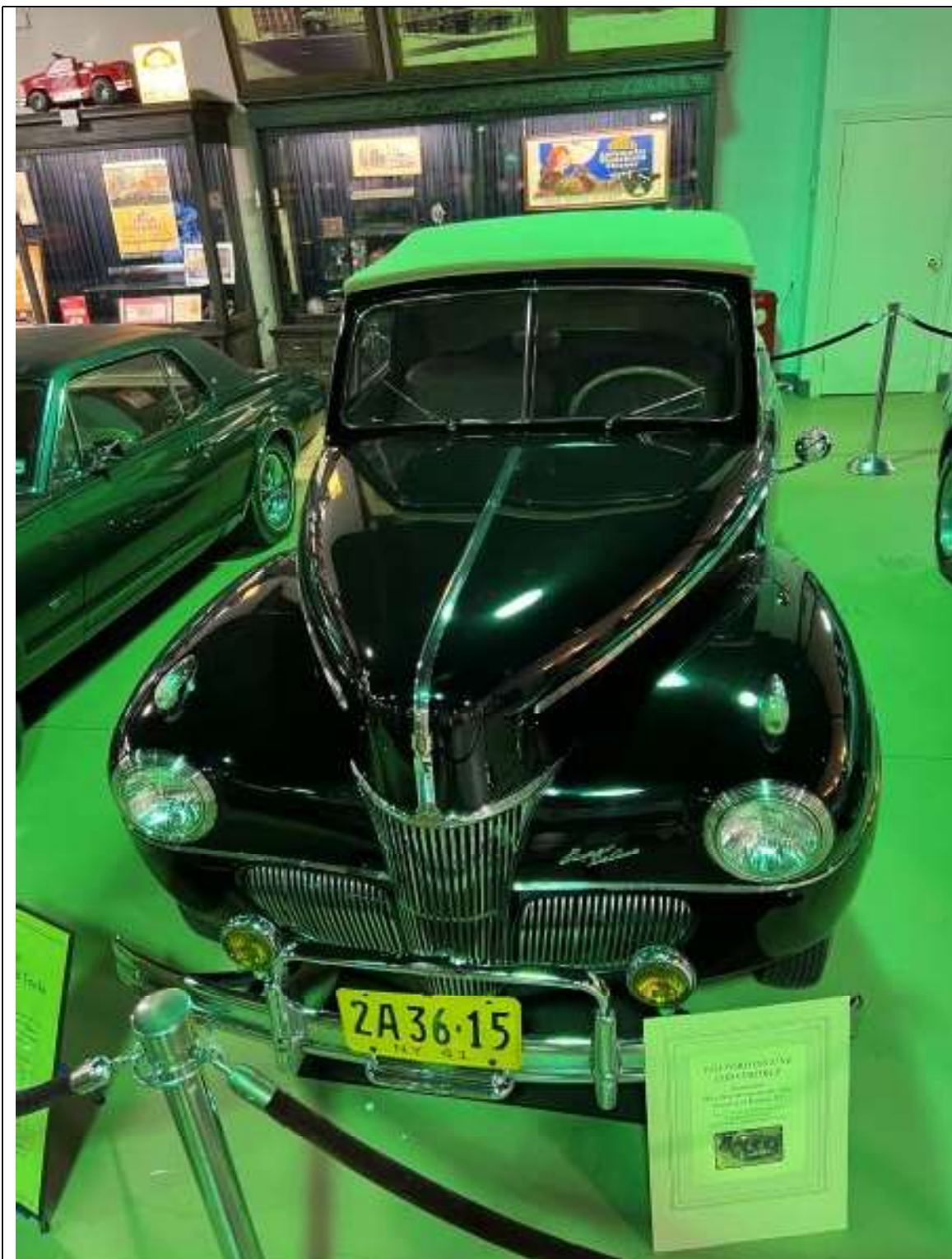
1941 Ford Deluxe