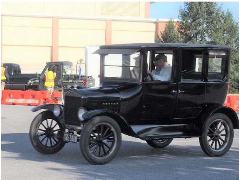
Driving onto the Show Field