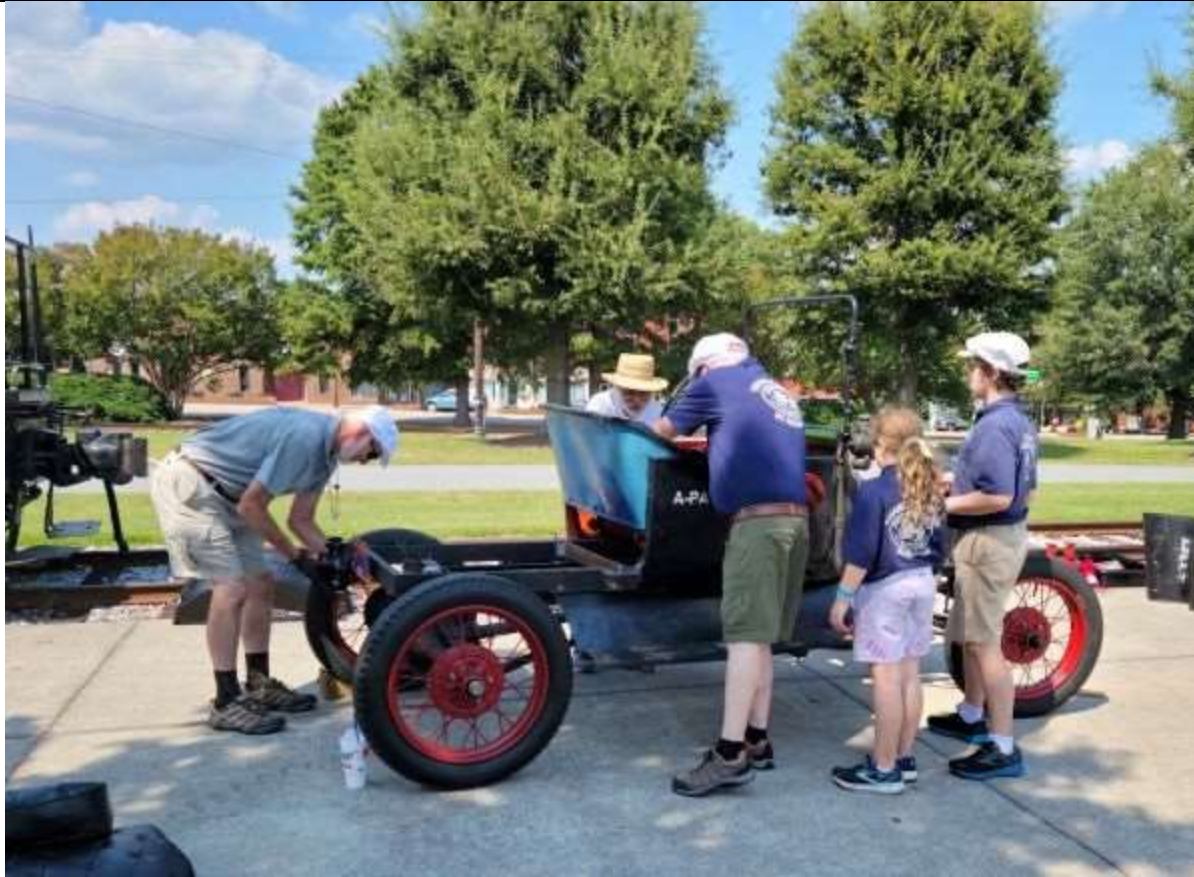
Everybody hard at work