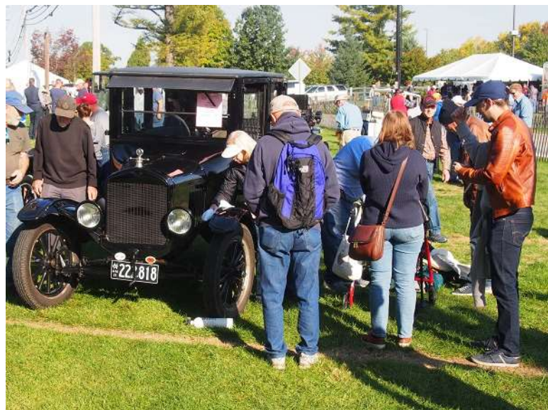
You missed a spot