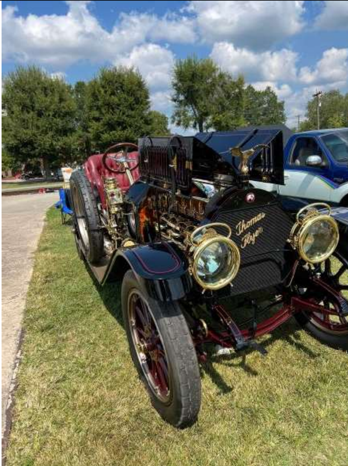
Thomas Flyer What a beauty!