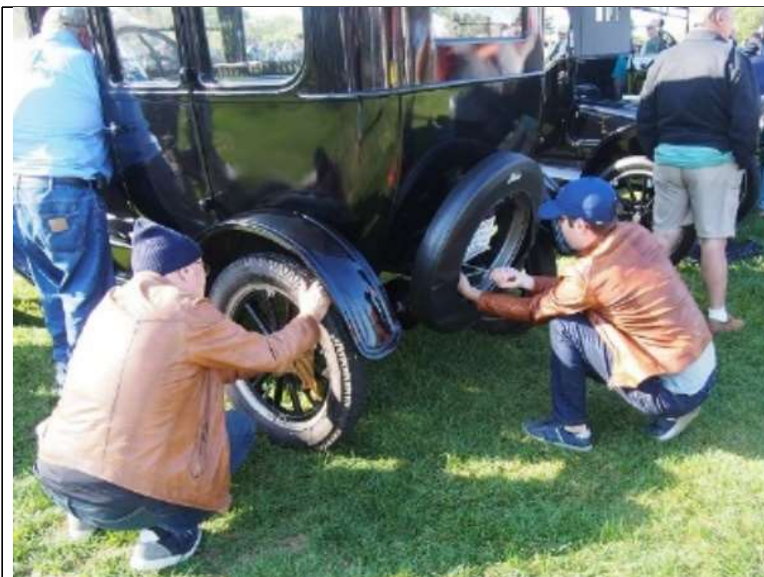
That's it, look very carefully