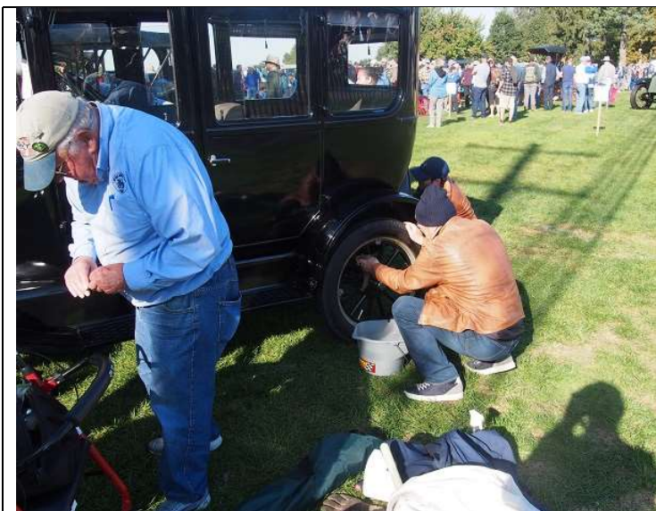
That was working when we left