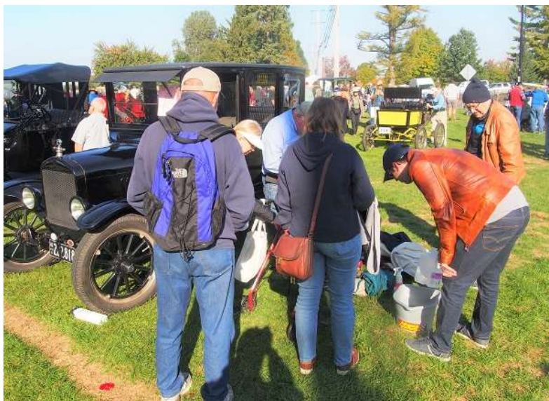
Now listen this is what I want done