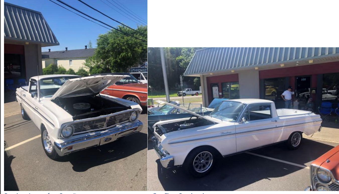
Ranchero is one of my Favorites