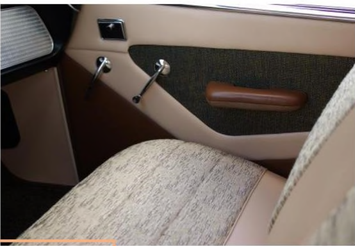
Interior photos of the Hawk