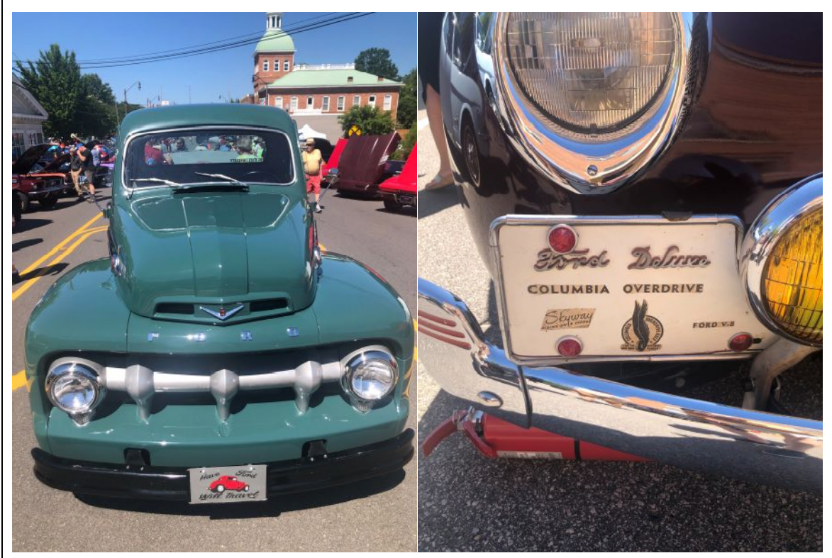
Who is that Ford Guy!