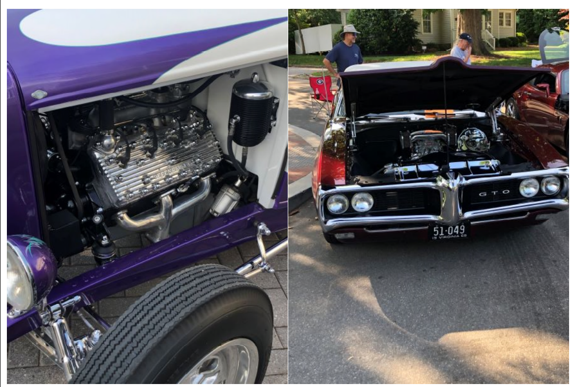
GTO at the show