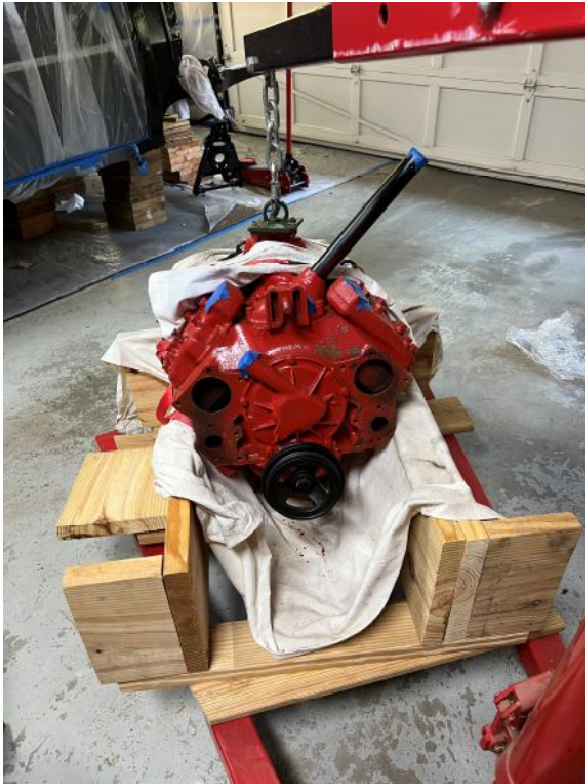
Preparing for Water Pump Install