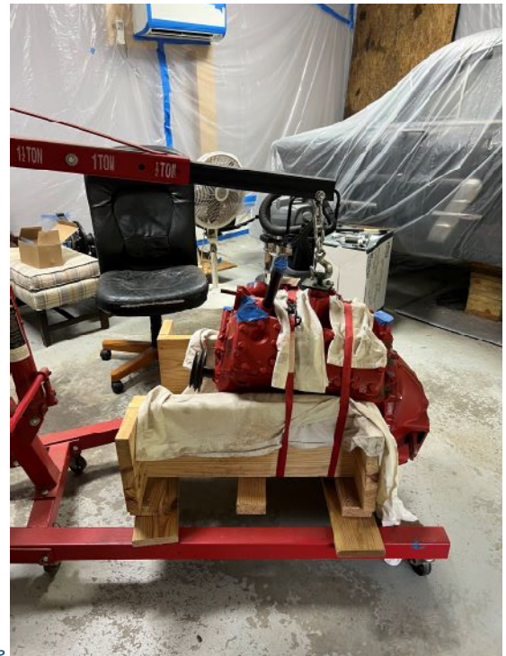
Changing the hoist point