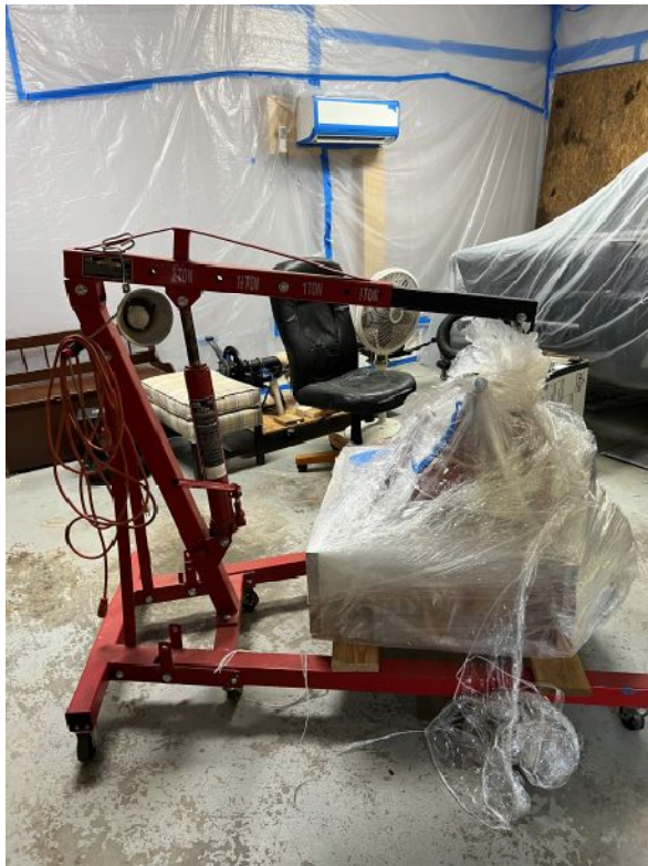
Unwrapping the Engine