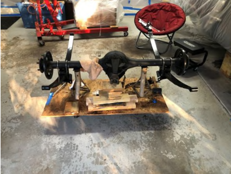
Rear Axle, Springs Prepping to Install