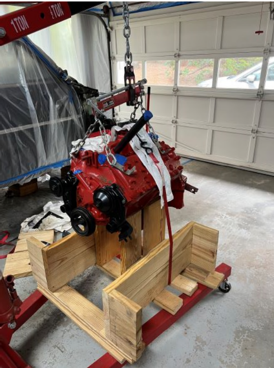
Hoist Pt Changed & Motor Mounts Install