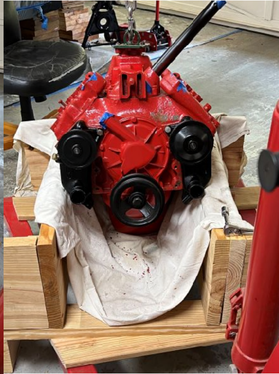
Water Pumps Installed