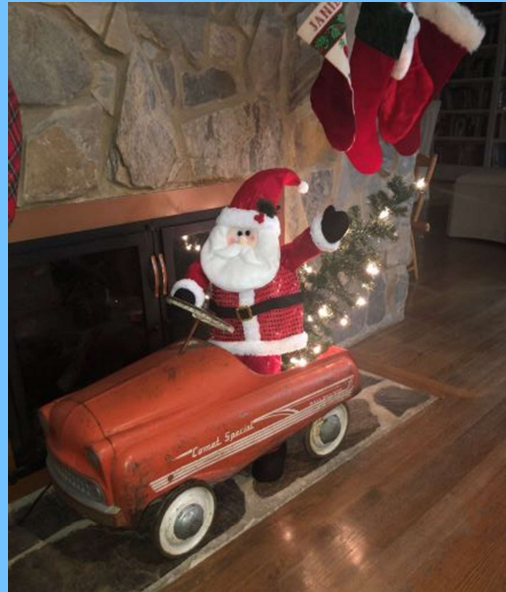
1961 Murray Comet Special