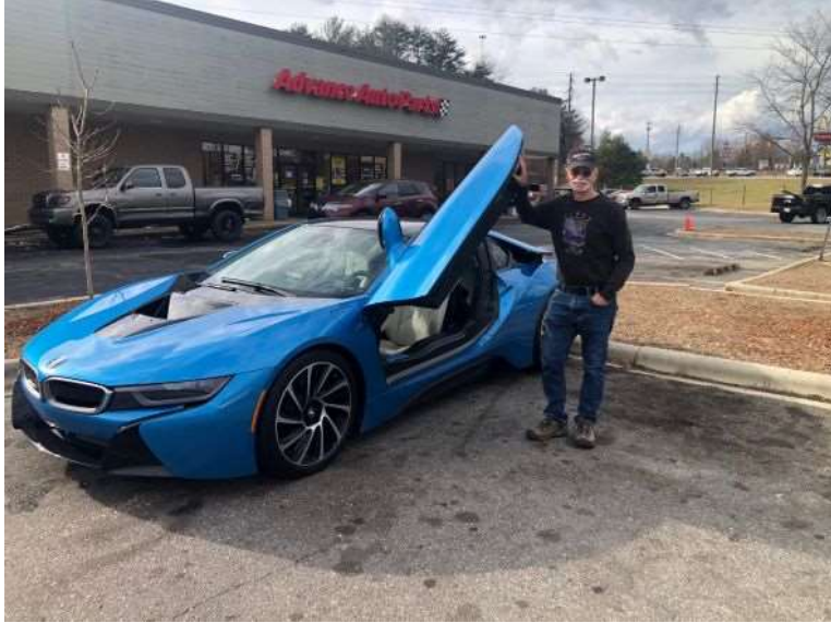
Craig Root's 2018 BMW I-8