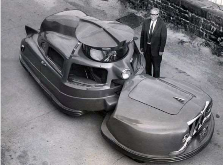
1958 Sir Vival