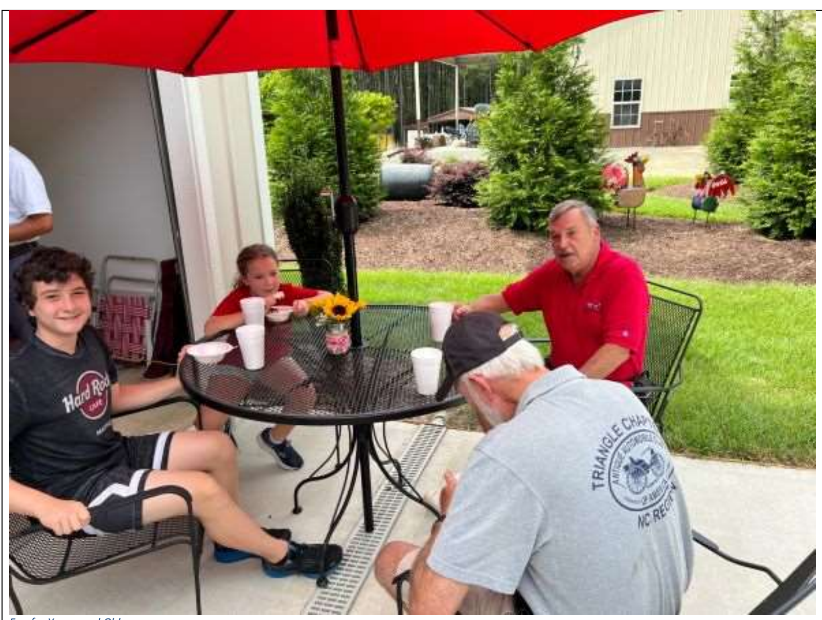
Fun for Young and Old