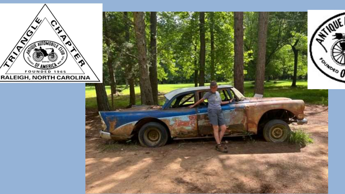
One of Cars at the old Orange County Speedway. Closed in 1965