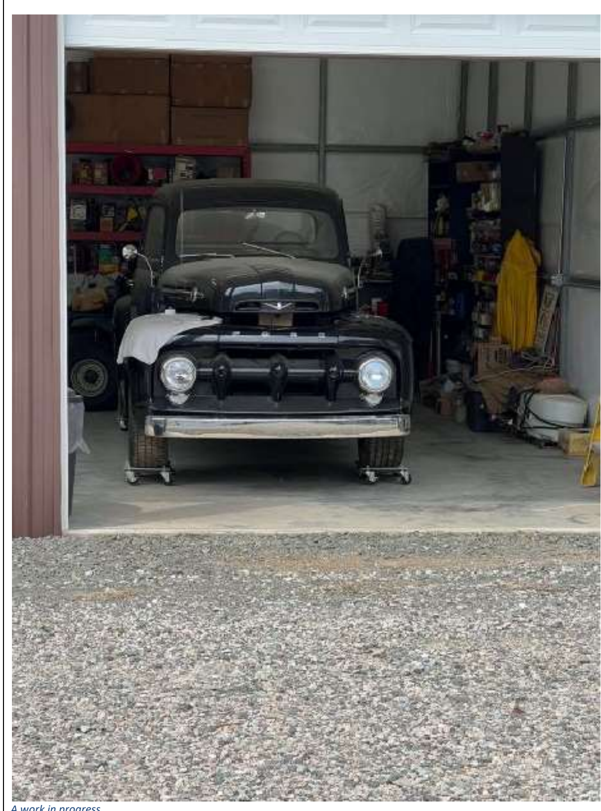
A work in progress