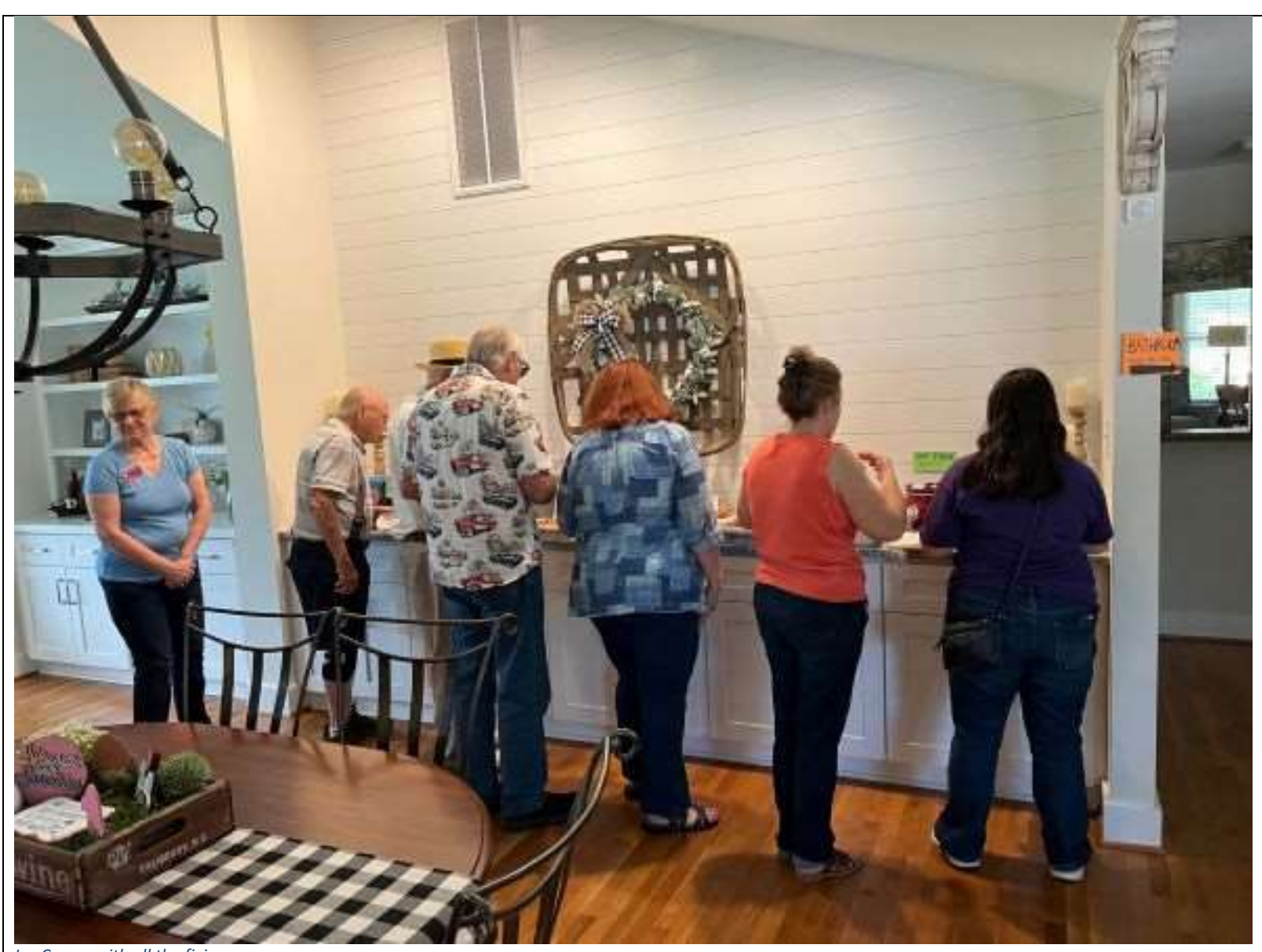
Ice Cream with all the fixins