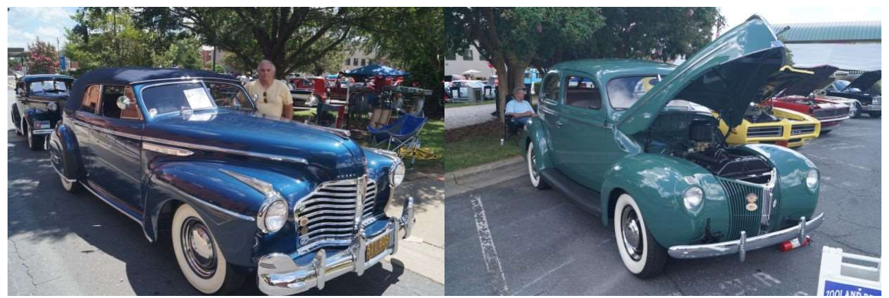
I like that green