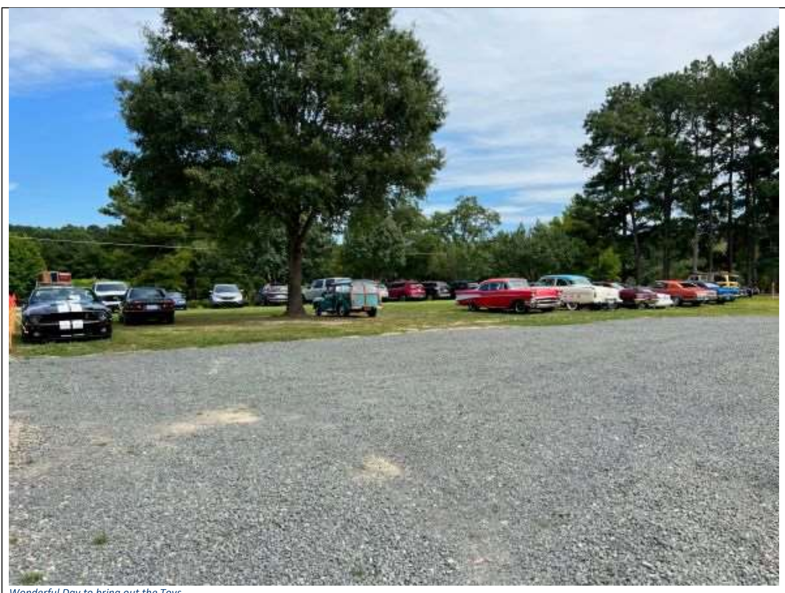
Wonderful Day to bring out the Toys