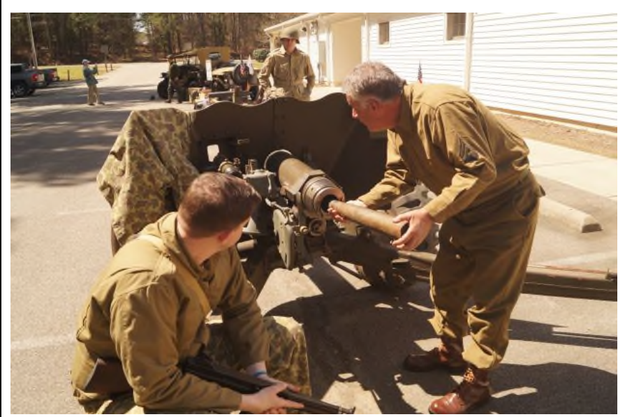
WW II ARTILLARY