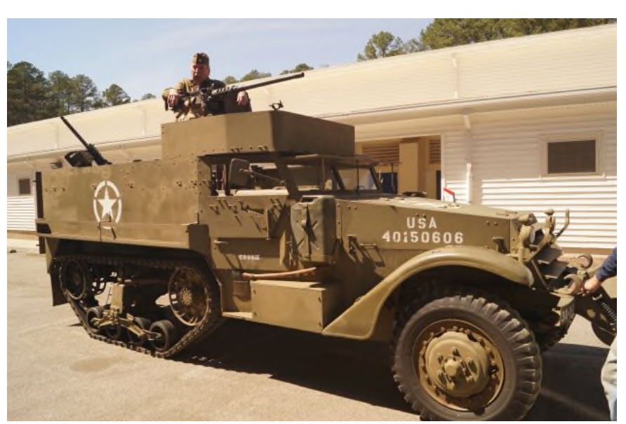
WW II HALF TRACK GUN MOUNT