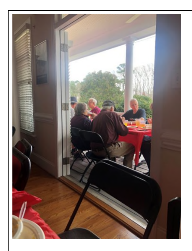
TABLE FOR 20 ON THE VERANDA PLEASE!