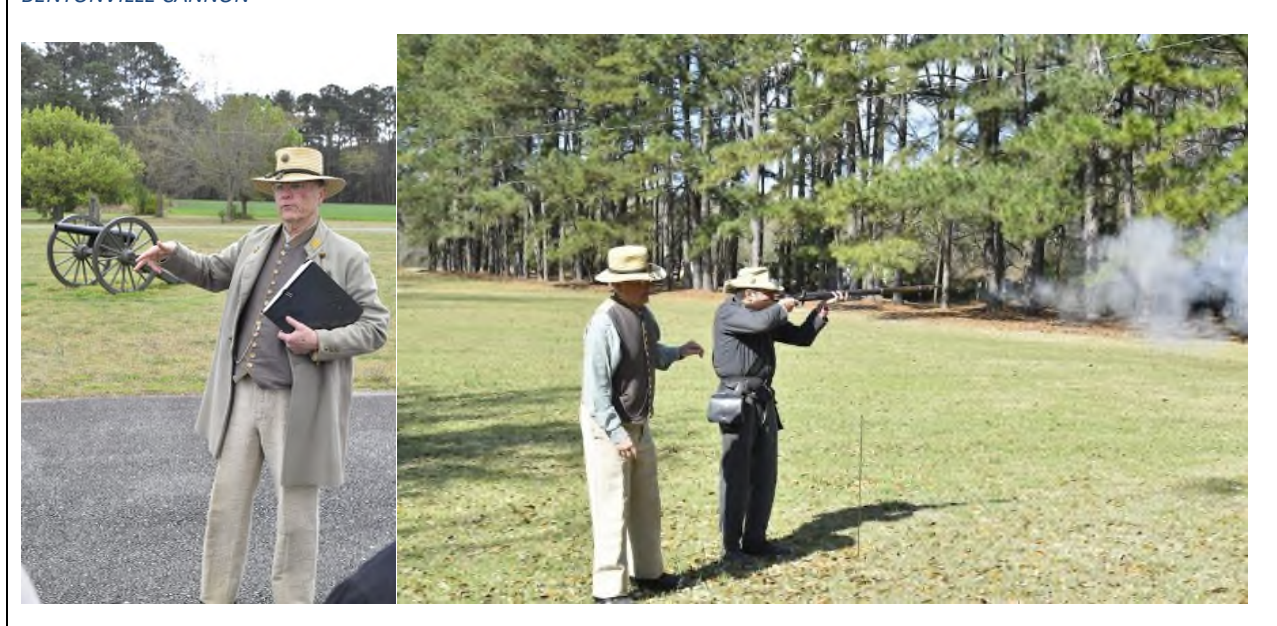
BENTONVILLE SHOOTING DEMO