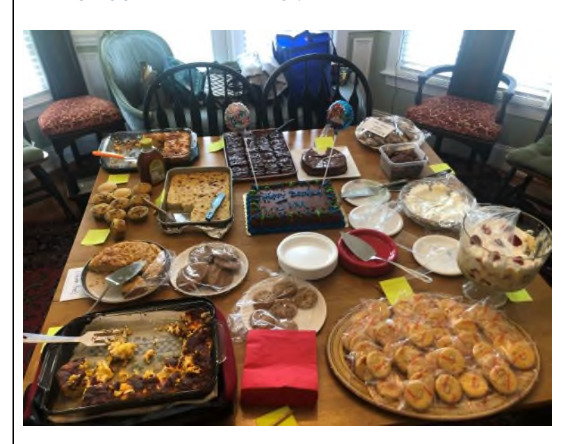
SAVE ROOM FOR DESSERT