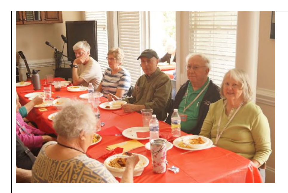
TASTY FOOD GOOD CONVERSATION