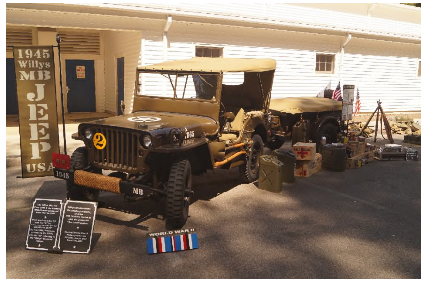
1945 JEEP WWII ERA

The exhibit was well attended and enjoyed by the public.