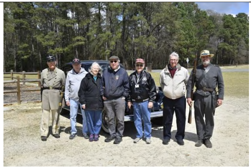
THE GROUP AT BENTONVILLE