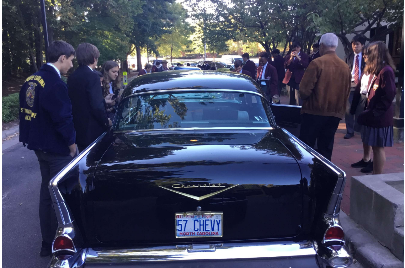
Denny Ostreich's 57 Chevy