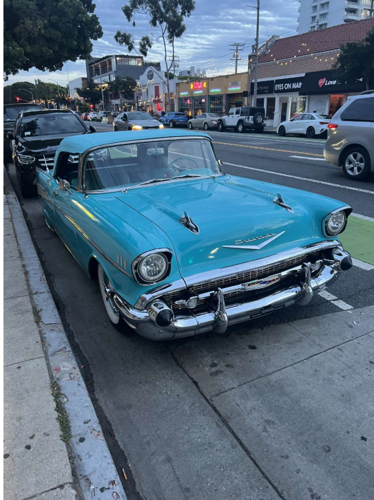
57' Chevy seen recently in Santa Monica