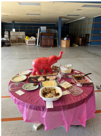
Pink Elephant Surprise Visit ^