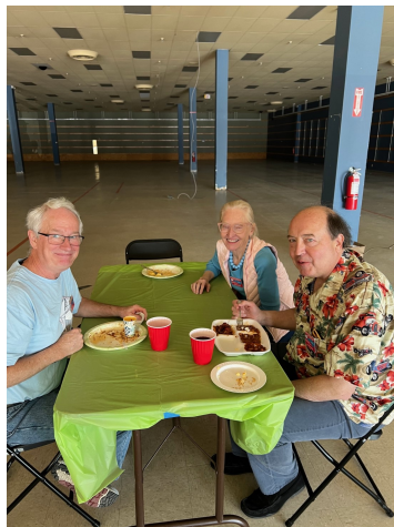
The Kid's Table ^