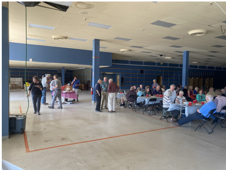
Fun for all