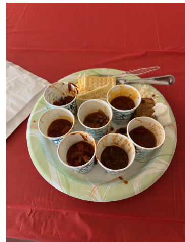
Their all good! ^