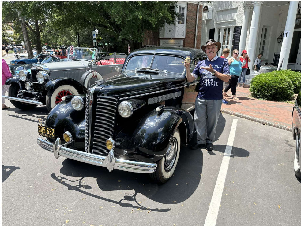
Harlow Pinehurst 2024