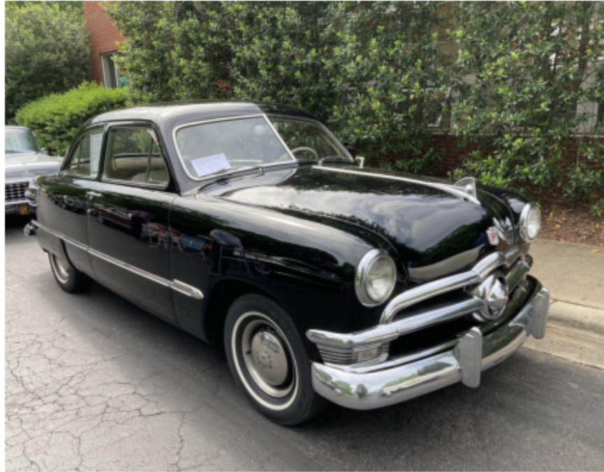
Chet Butcher 1950 Ford Tudor Custom