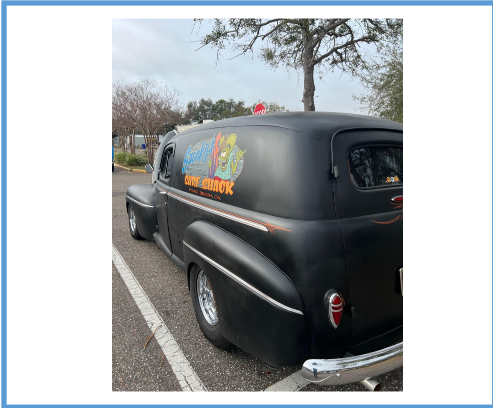
Gary's 42 Ford Panel truck– St Pete Beach