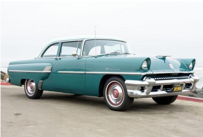
“A picture of a similar 55 Mercury Custom”

My plan for a first car started to come together when I was 16 years old. I was able to save $300. The 1955-1957 Chevys were all about $700 to $900. It would have taken me another two to three years to save that much money. So, I began looking in the back rows of the local car lots for a worthy $300 vehicle. I found a 1955 Mercury Custom two door sedan. It was blue with a white top. It was freshly painted albeit with a paintbrush. It had four retread tires. The engine was a 292 Ford V8 and the transmission was a three speed standard transmission with an over-drive unit. Best of all the car dealer could start it. I later learned there are tricks to starting a car that dealers know but do not divulge. After an agreement with the dealer for my $300 and my father’s permission I was able to drive it home.