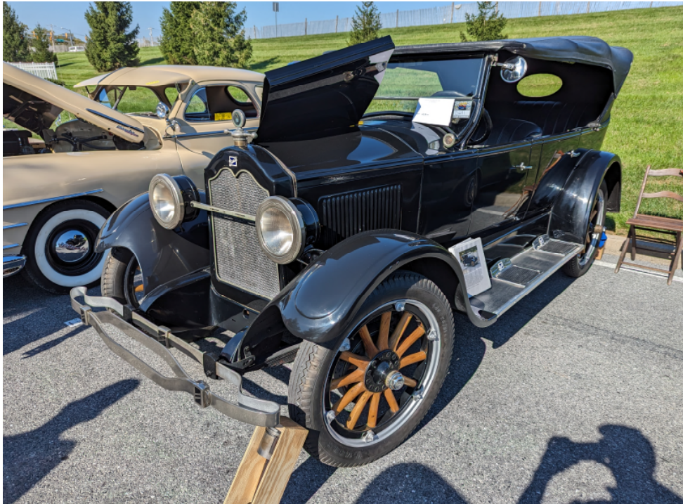
Their new 1924 Buick Touring