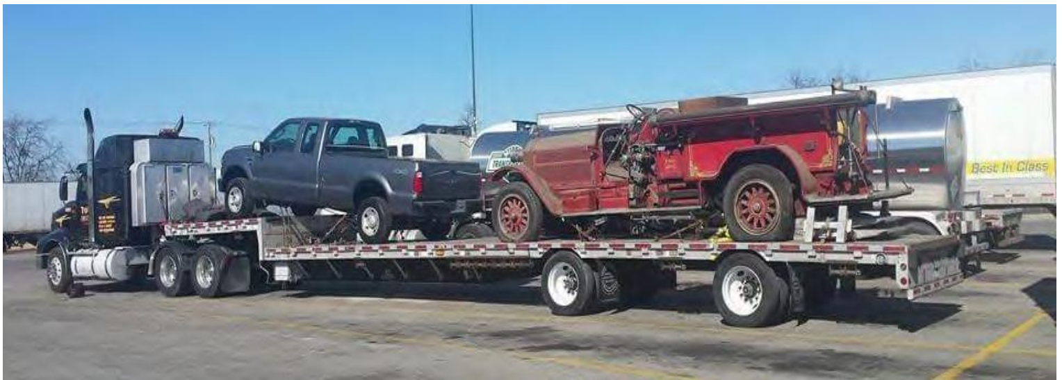
1928 American LaFrance returns home to Cleveland