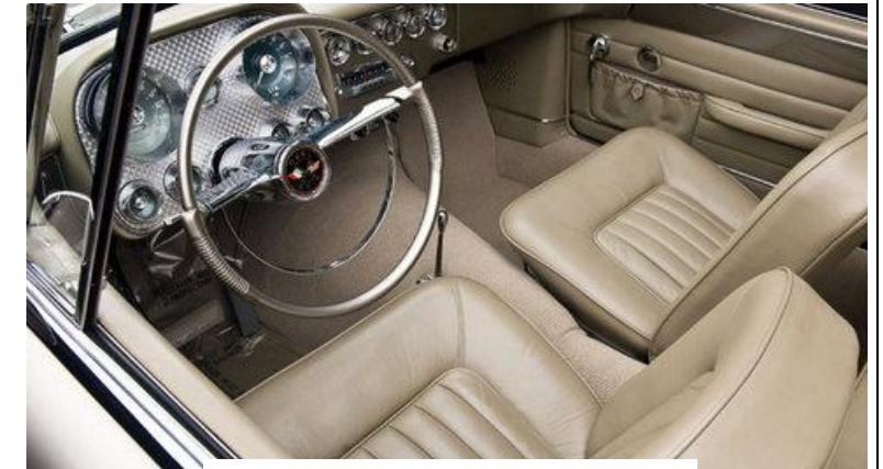
Figure 2. Dual-Ghia Interior

The 230 hp, 315 cu. in. Dodge D-500 "Red Ram" OHV V-8 engine with a Carter four-barrel carburetor, two-speed Chrysler Powerflite automatic transmission were used for most of the cars produced. A few used the Dodge 361 cu. In. engine. There was an independent front suspension with unequal length A-arms and coil springs, live rear axle with semi-elliptic leaf springs, and four-wheel hydraulic drum brakes. The wheelbase was 115 in.