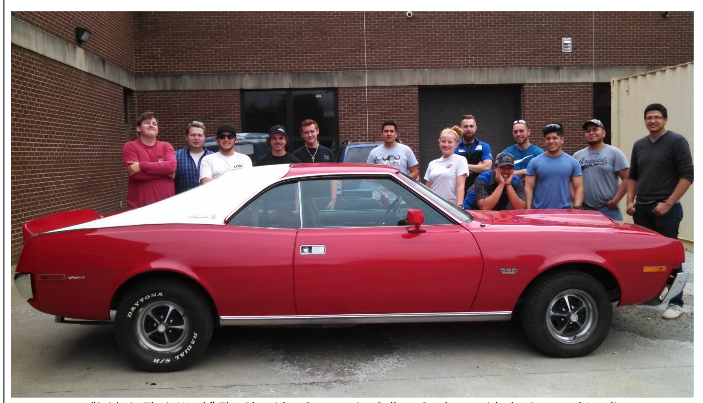
"Pride in Their Work" The Blueridge Community College Students with the Restored Javelin