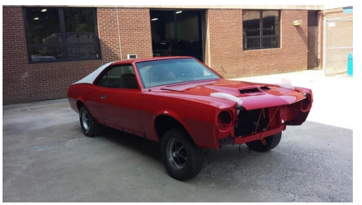
1971 AMC Javelin SST after cleanup and paint