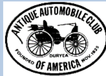
Car of The Month