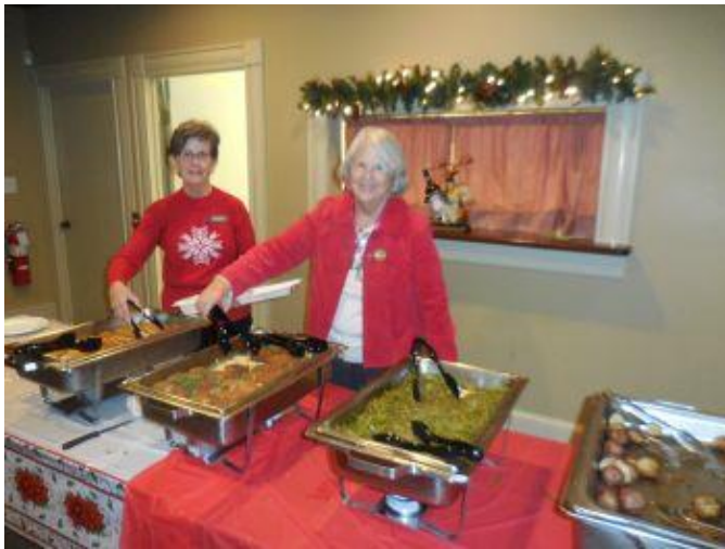
The buffet table with seconds.