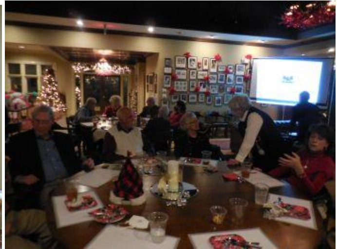
Social Hour discussions