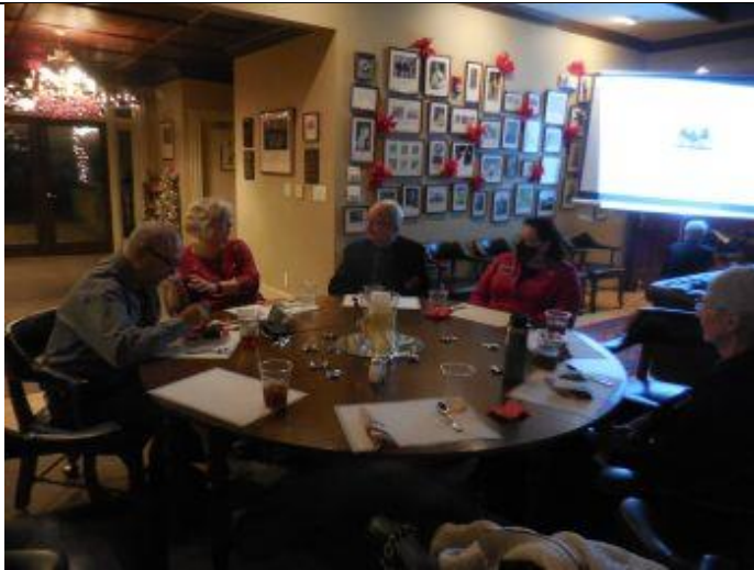
Members in discussion