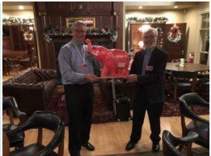
Formal Pink Elephant Guardianship Transfer