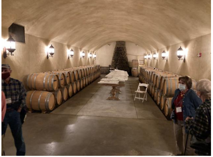
The Winery Restaurant