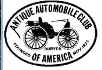
Car of The Month