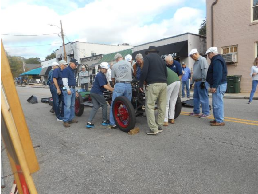
Heavy Lifting – The motor and Transmission