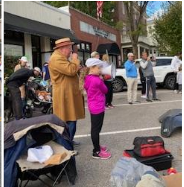
The Sound Team