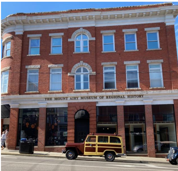
Mt Airy Museum

All and all, a pleasant time was had by all, and we wish to extend our deepest appreciation to our hosts for an exceptional tour.