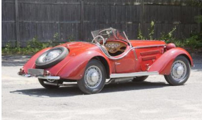
1938 Wanderer (A Similar Vehicle)