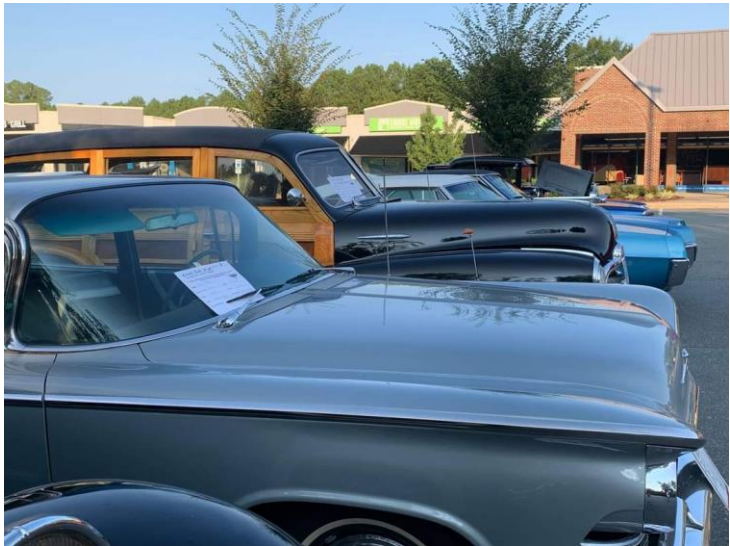
Over the hoods