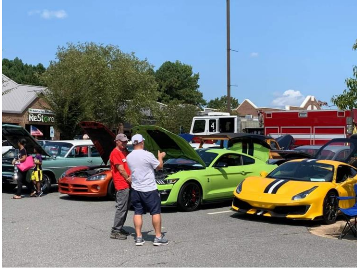
Use the Wide angle for that car