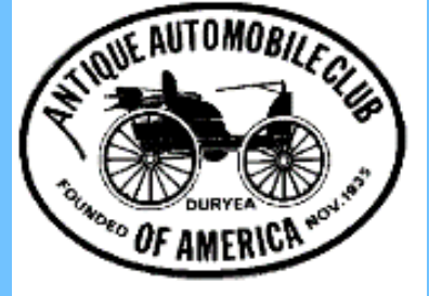
Car of The Month