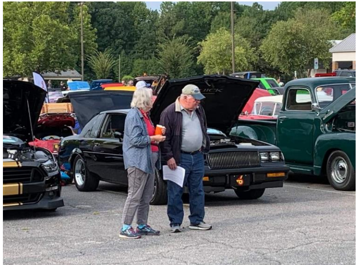
Les; "Whose car is leaking fluid?" Riley; "Probably one of Denny's Chevrolets."