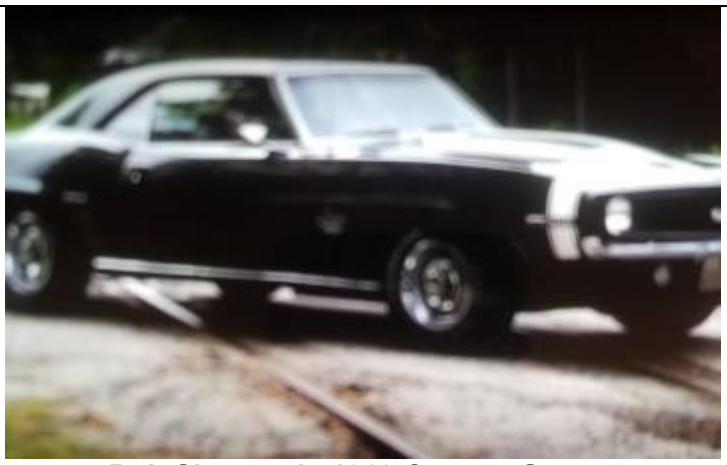
Bob Simpson's 1969 Camaro Supersport