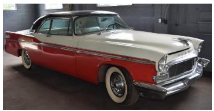
1956 St. Regis Chrysler New Yorker