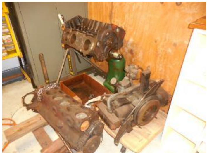
Engines (Chevy, Ford 6, Volkswagen)