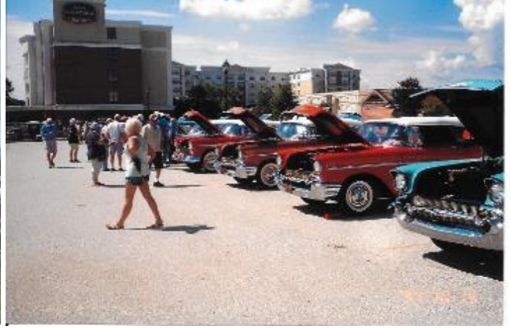
Show Field and Hotels