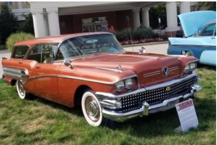
The Zenith Award - 1958 Buick Century Caballero