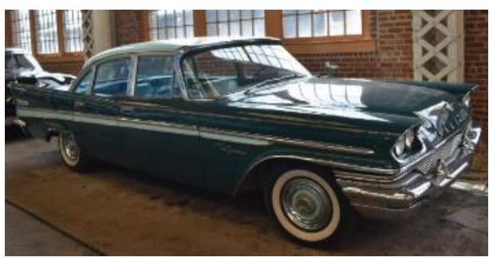
1957 Chrysler New Yorker