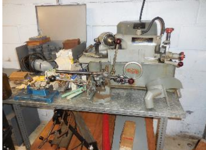
Many NOS Parts