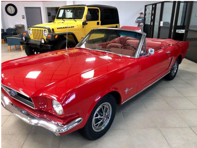
1965 Mustang Convertible Sold $15,000