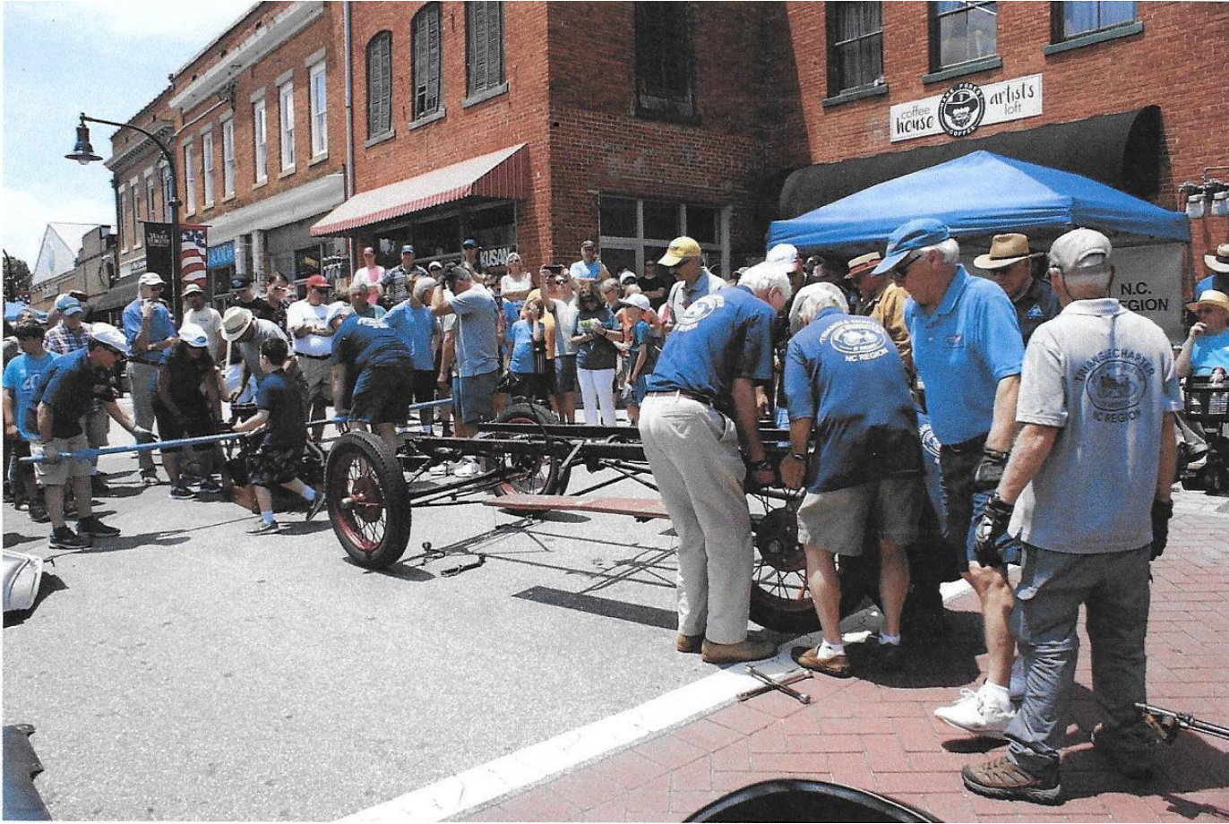
The Engine Lift