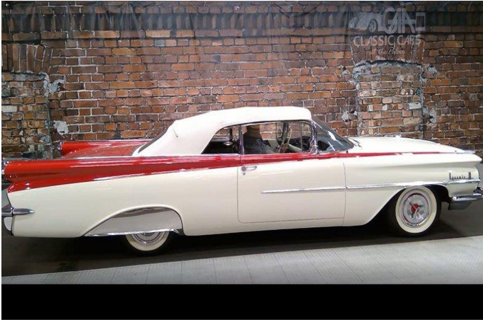
1959 Oldsmobile Sold $50,000