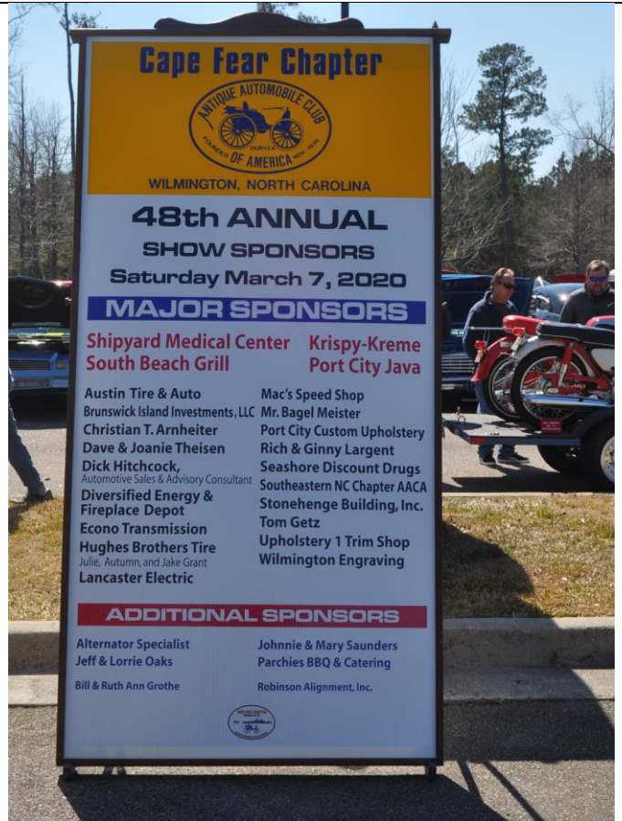
The Cape Fear Sponsor Board