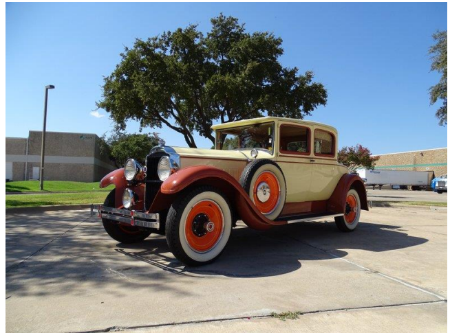
1929 Packard High Bid $29,000 (Not Sold)