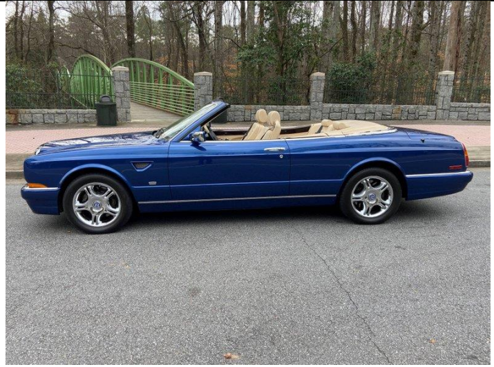
2003 Bentley Sold at $47,500