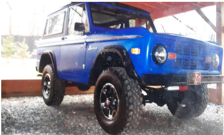
1974 Bronco Sold at $16,500

Have a look at some of the interesting vehicles we seen below.