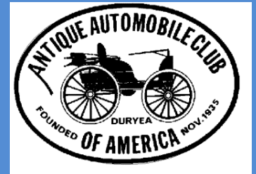
Car of the Month