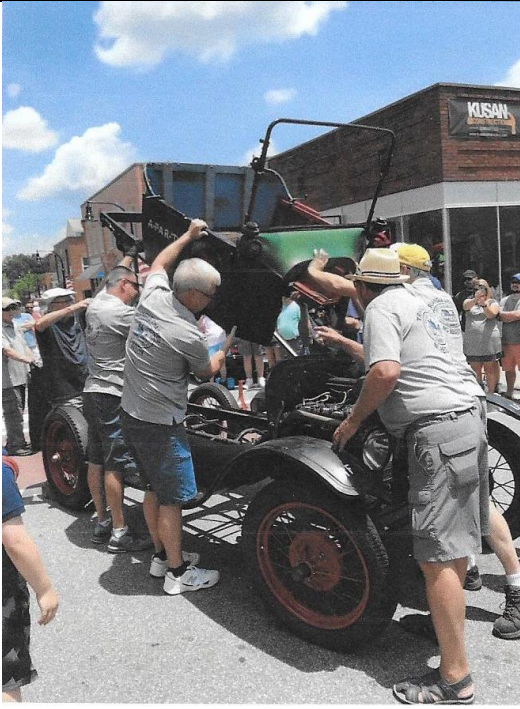
The Body Lift