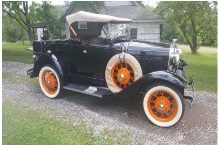
1931 Model A Ford