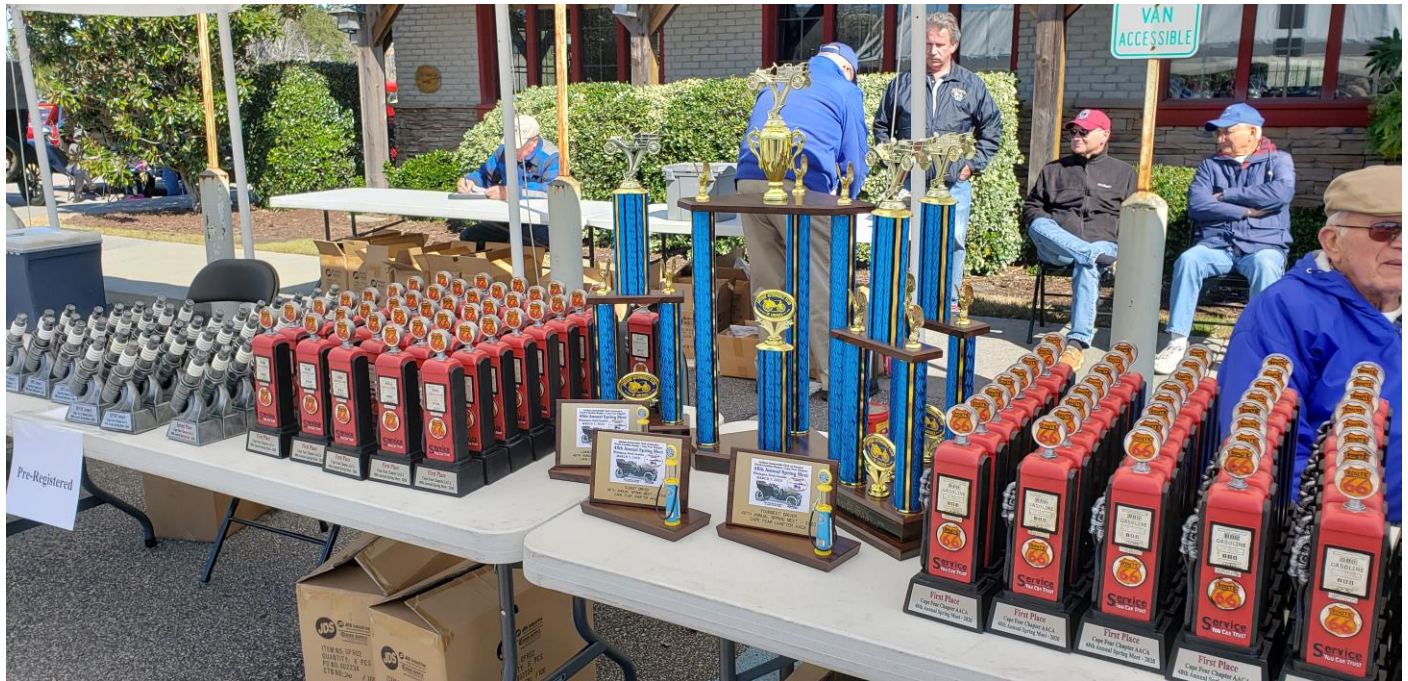
The Awards Table Participant Spark Plugs (Left), 1 st Place Gas Pumps (Right), and Special Trophies (Center)