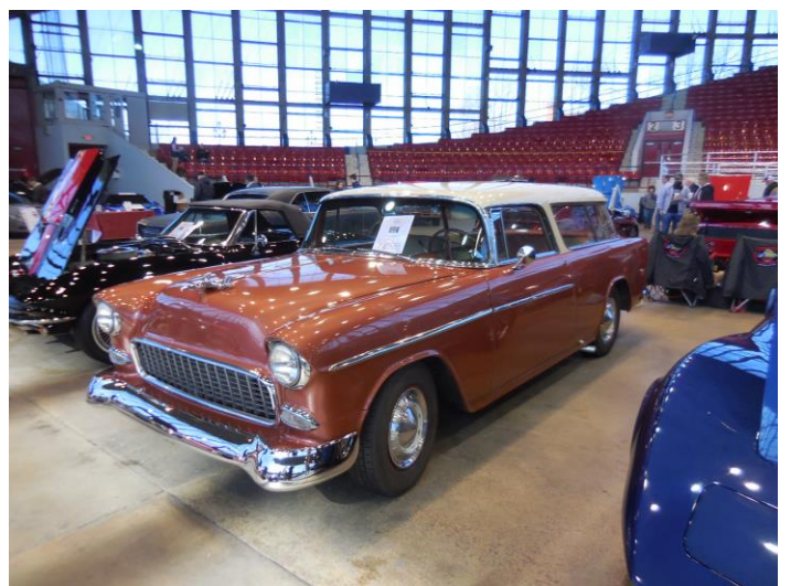
Floyd Barnes 1955 Chevrolet Nomad