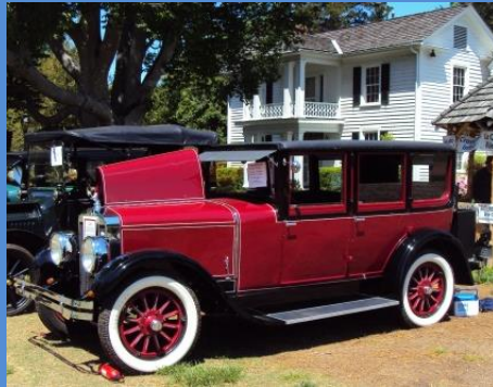
Car of the Month