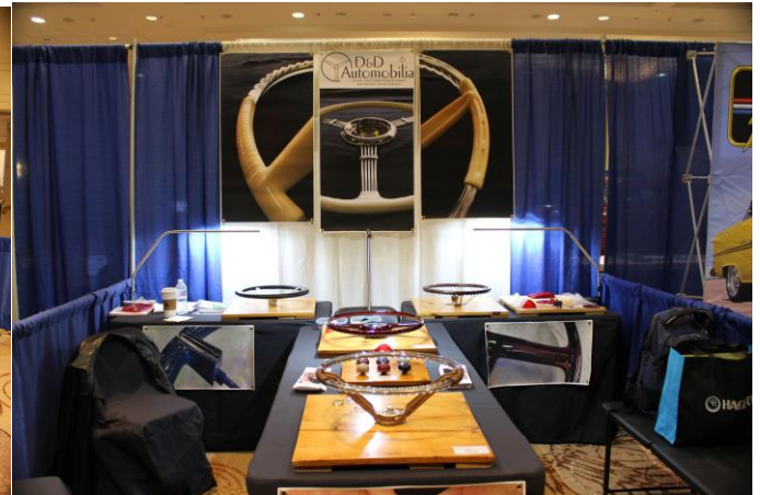
Steering Wheel Restoration Display