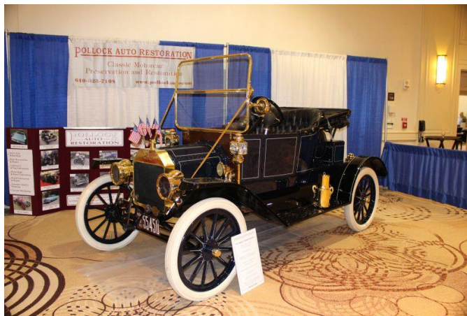
An Early Model A Professional Restoration