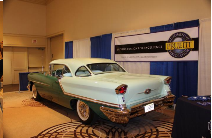
An Oldsmobile 88 on Display