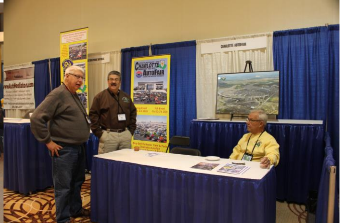
Booths for advertising upcoming events. The Hornet's Nest advertising the Spring National