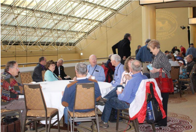
Morning Coffee with Friends