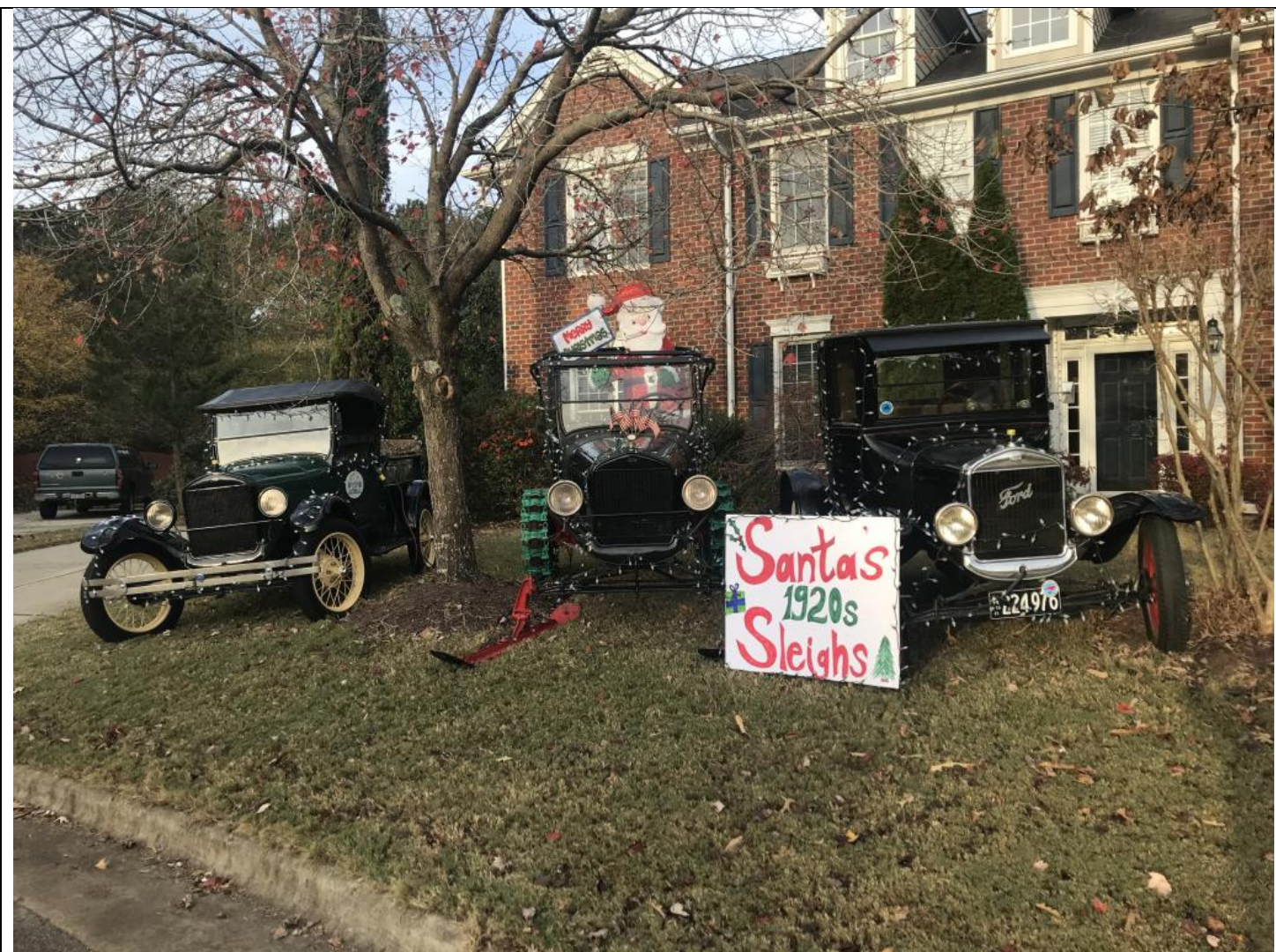
Jim Gill's Christmas Display