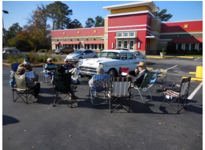
The Discussion Group