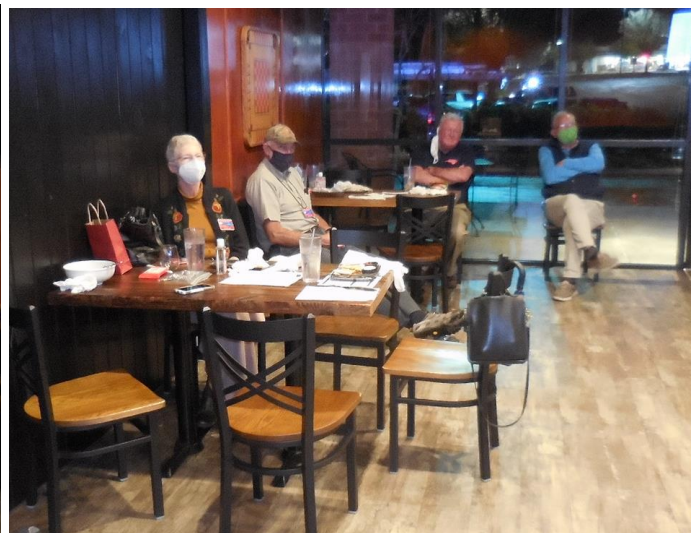
Right side Members