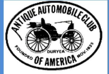
Car of the Month