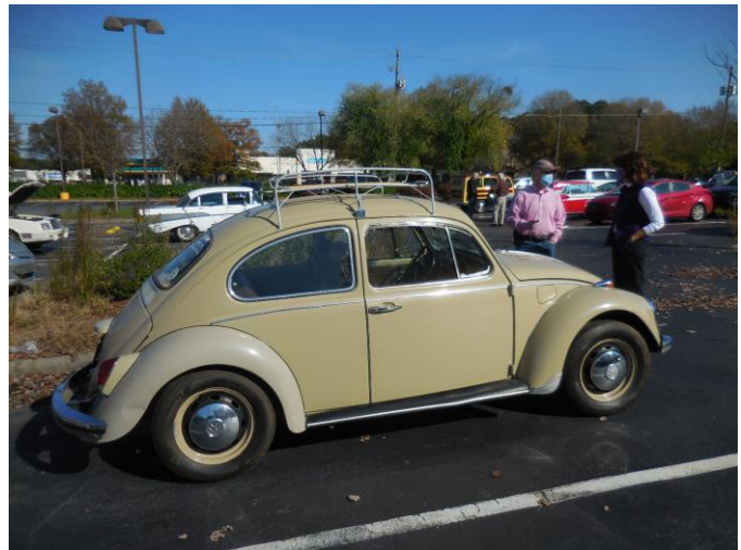
Tom Pruett's VW