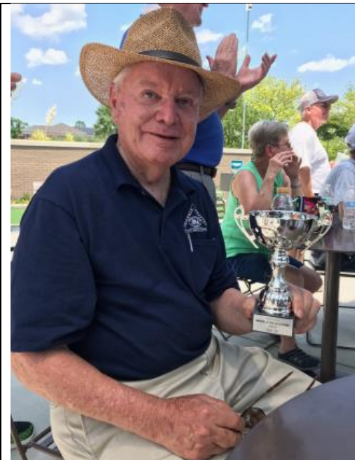
Wheels on Academy Cary Mayor's Award