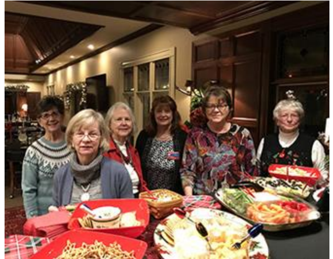
Holiday Party Hors D'oeuvre Crew