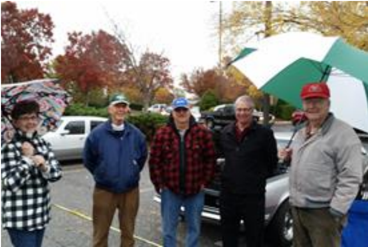
Chick Fil-A Display Day w/Rain