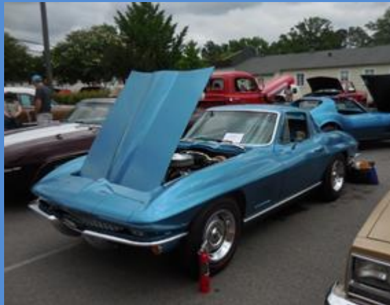
Car of the Month