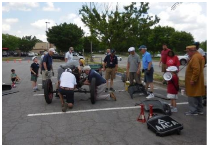
Triangle Car Show Take A-Par-T Team