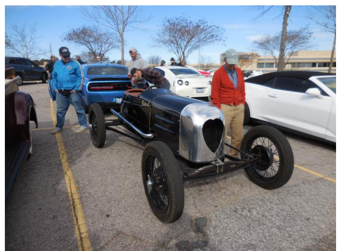
One of Many Modified Vehicles