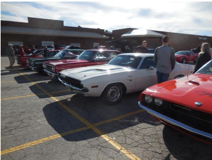
The Dodge Group