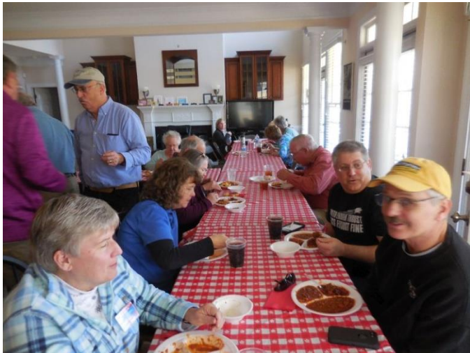
2019 Chili Cook-Off