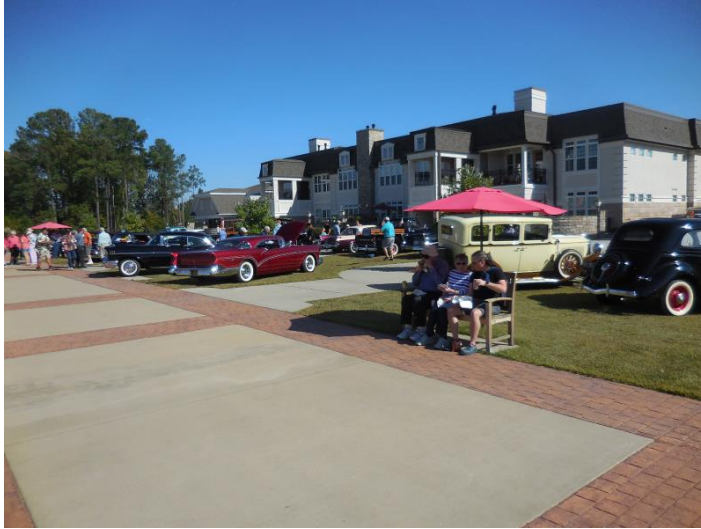
Display Field at Searstone

grounds were provided by some of the car owners and enjoyed by the residents. Over 70 Searstone residents plus their families came to the display. Searstone provide us with a hot dog lunch.