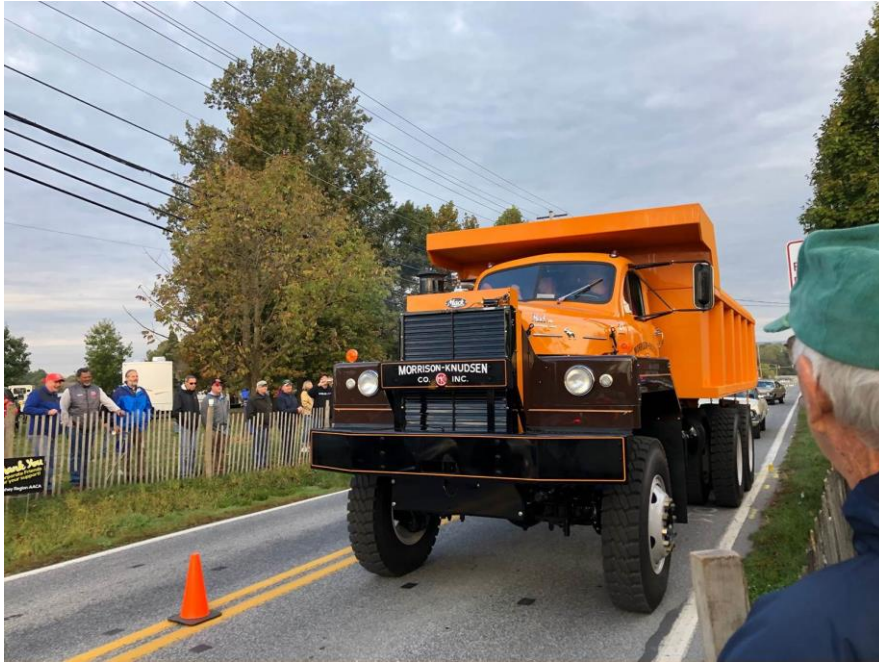
The Parade of Vehicles entering the Show field

time this year and look forward to meeting friends again next year. Here are a few of the pictures.