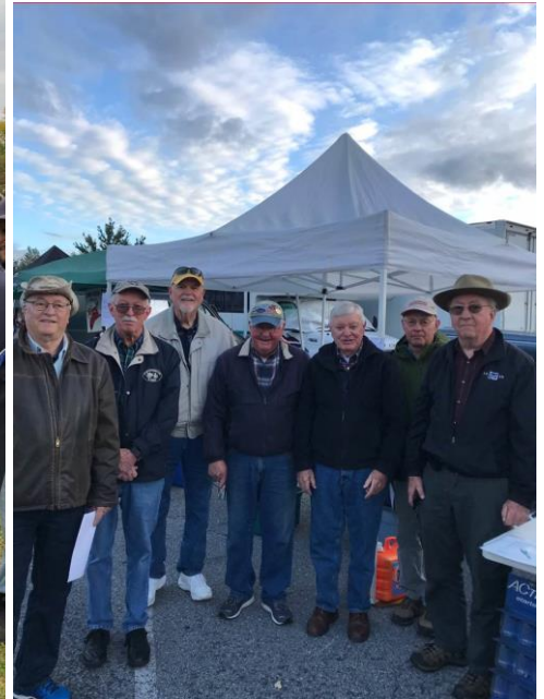
The Gang at the Swap Meet Tent