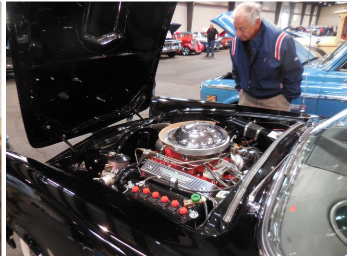
1956 Thunderbird (Sold at $53,000)

At this auction certain vehicles showed they still command higher prices as collector vehicles while others show that collector interest is waning. Vehicles holding or increasing their value include mid 60s Corvettes at $45,000 to $60,000. Mid 60s Ford big block (390-427) cars were garnishing $35,000 to $45,000. 1960s Mustangs seem to continue to be high value demand vehicles with bids between $14,000 and $67,000. The older vehicles got low bids at this auction including a 1928 Whippet $11,000, a 1929 Packard $15,000 and three Model As sold between $7,750 and $10,750. However, a 1954 red Hudson Hornet Convertible sold at $78,000.