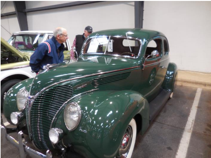
1938 Ford Deluxe (Sold at $32,000)