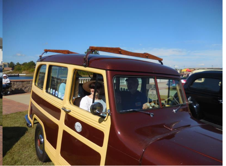
Dan Fuccella giving rides