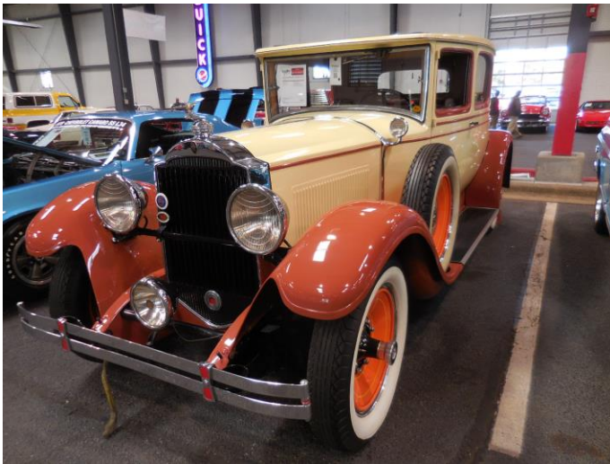
1929 Packard (Not Sold at $15,000)

Several Triangle members attended the recent Goldsboro Auto Auction. There were 530 vehicles for sale. Most vehicles up for auction were between 1960 and 2000. Many trucks were up for auction. There were only a few early year vehicles, but many vehicles between 2000 and 2010. There was even one brand new 2020 Toyota Supra, which did not sell at the bid of $60,000, the sticker was $79,000.