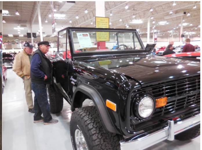
1970 Bronco (Sold at $49,000)