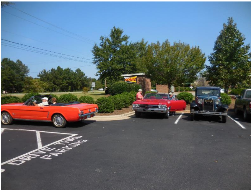
Staging in the Parking Lot

It was amazing to see the growth of subdivisions and new homes everywhere in Northern Wake County. The Gallery visit was prearranged so we got to watch as the glass blowers were making multicolored pumpkins. There was time to view the facility and do some shopping.