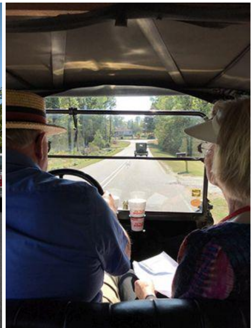
A View from Reiner's Back Seat.