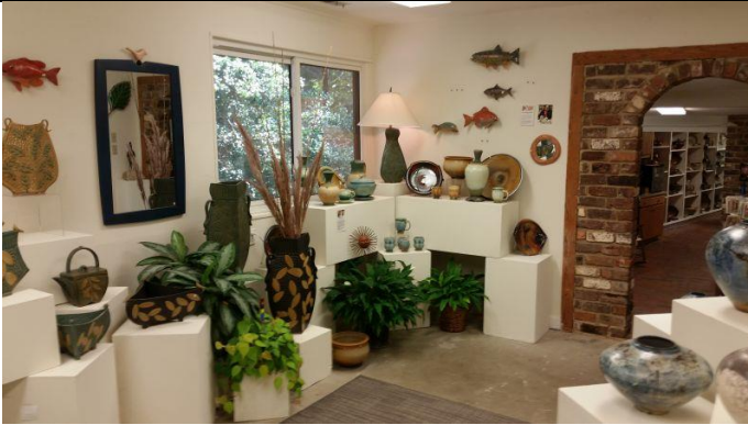
Pottery and Art Objects for Sale