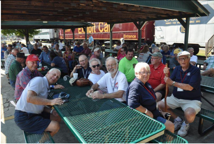
The Triangle Gang Enjoying the Fall Region Meet