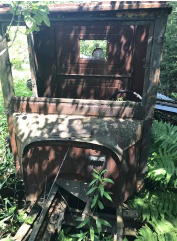
Model T Parts