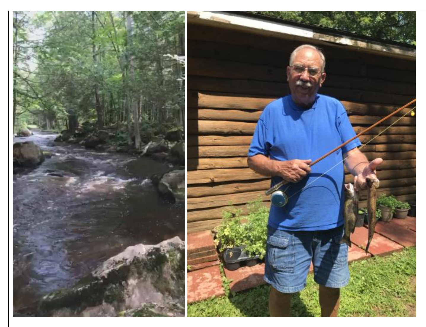
The Gill Trout Stream