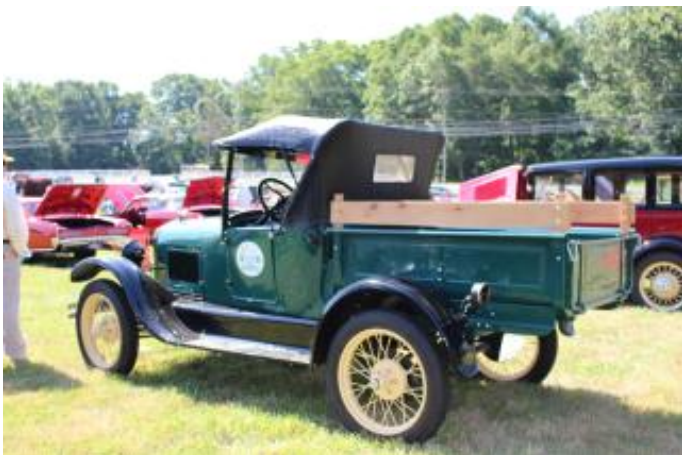
Jim Gill - 1927 Ford Pickup DPC