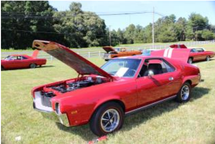
Mike Hess - 1969 AMC AMX 1 st Redbird