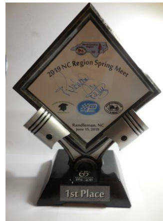
NC Region Spring Meet Trophy

The Petty Race shop has been converted to a museum and restoration facility with racing mementoes, trophies, and race cars. Additionally there were no less than 15 vehicles undergoing restoration. The back shop is used to modify new performance cars to very high performance "Petty Garage" vehicles sold by new car dealers. The museum displays Richards Petty's collection of trophies guns, jackknives pocket watches and Race cars.