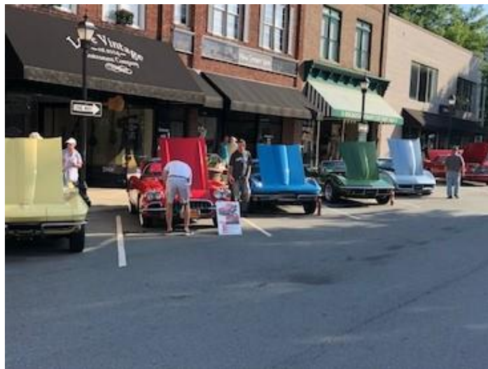
The Corvette Entries