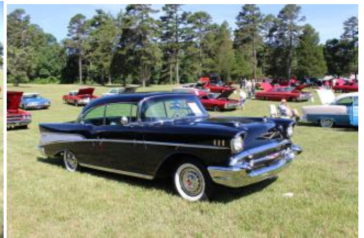
Denny Oestreich - 1957 Chevrolet Red Bird Pres