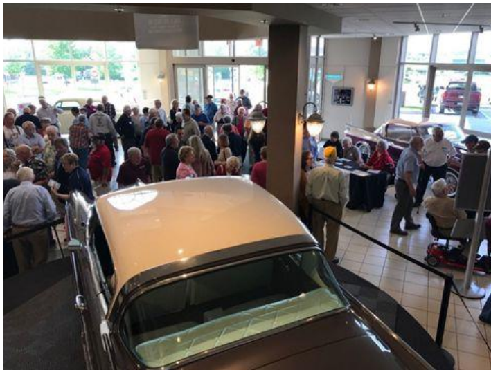
Opening Night Crowd

Ironically, I had just sold my 1955 Studebaker Speedster to an officer of the museum and it would be parked on a platform adjacent to my Hawk. There was already a large crowd in the lobby and the sign-up registration was directly next to my Hawk. What a prime location.