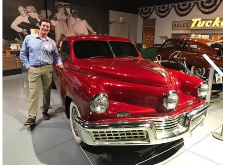
The Museum's Tucker Display

Well it's not a bullet nose Studebaker, but my grandson liked it just the same ....a TUCKER. There is a large permanent display of four Tucker cars with factory memorabilia available to enjoy.