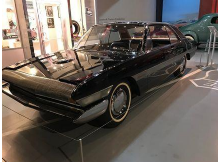
1966-67 Studebaker Prototype (Sceptre)

Another significant Studebaker vehicle on view was the 1908 Studebaker Electric Carry-all, one of only two vehicles built on special order from the US Congress by the Studebaker Corporation. It was used to transport Senators and Congressmen beneath the Capital dome. The vehicle was designed with a pair of driver's seats, one facing in each direction, since the tunnel in which they operated was too narrow to turn around. It carried 12 passengers as fast as 15 miles mph through a tunnel just over 1000 feet long, A typical day involved as many as 225 trips.