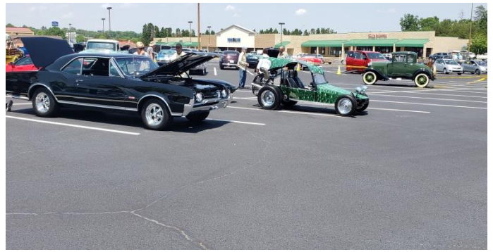
Original and Hot Rods

As the day went on, it becomes hotter and hotter and the Tractor Supply Store began to enjoy a booming business. Many participants had to leave before the awards. All concrete-no shade. The judging was somewhat based on AACA categories. Our 1990 Avanti did receive a 1 st place plaque in its class.