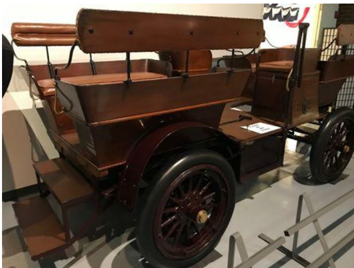
1908 Studebaker Carry All

Another significant Studebaker vehicle on view was the 1908 Studebaker Electric Carry-all, one of only two vehicles built on special order from the US Congress by the Studebaker Corporation. It was used to transport Senators and Congressmen beneath the Capital dome. The vehicle was designed with a pair of driver's seats, one facing in each direction, since the tunnel in which they operated was too narrow to turn around. It carried 12 passengers as fast as 15 miles mph through a tunnel just over 1000 feet long, A typical day involved as many as 225 trips.