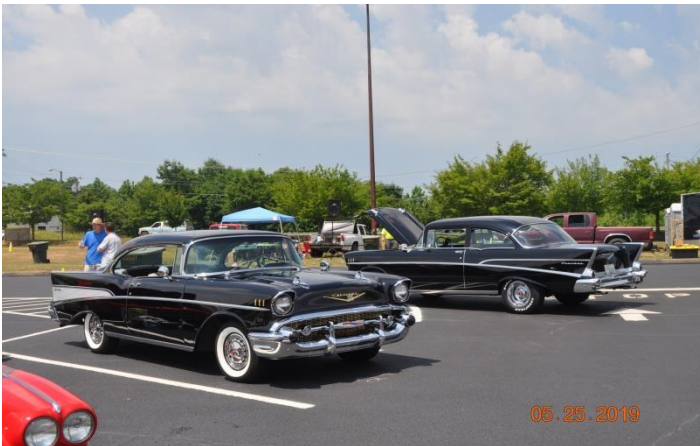
You're not seeing double, two cars different models

As the day went on, it becomes hotter and hotter and the Tractor Supply Store began to enjoy a booming business. Many participants had to leave before the awards. All concrete-no shade. The judging was somewhat based on AACA categories. Our 1990 Avanti did receive a 1 st place plaque in its class.