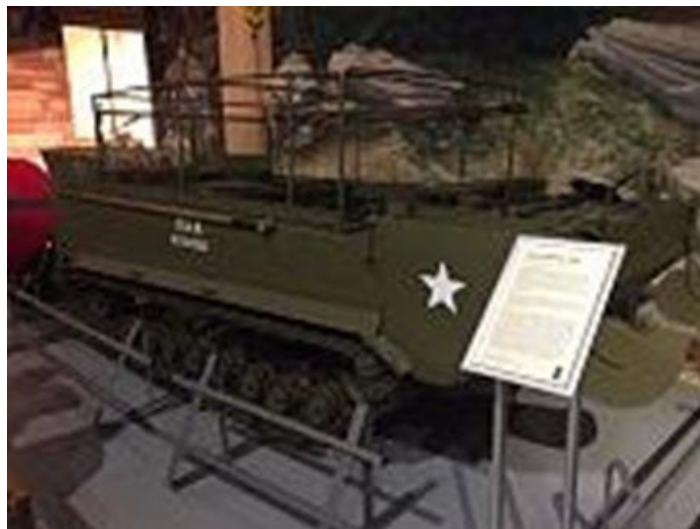
WWII Studebaker Weasel

The Weasel idea was introduced in 1942, when the First Special Services Force needed transportation into Norway to knock out strategic power plants. The vehicle needed to move quickly and easily through the winter snows of Norway. It also needed to be air transportable and capable of withstanding the effects of being dropped by parachute and would also be able to carry arms, explosives and minimal resupply stocks.