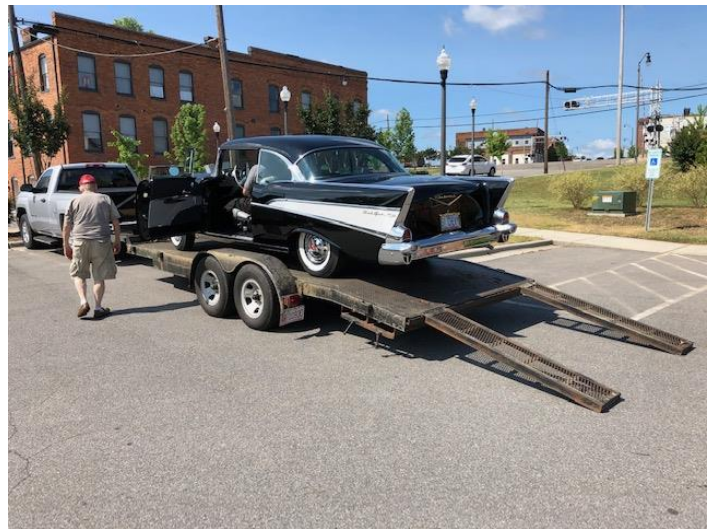
Denny Oestreich sneaking off the trailer

There was no doubt summer comes Early in Sanford, NC, but there was shade to be found for the entrants. A trip to Yarborough's Ice Cream shop was also in order.