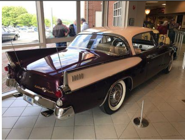
1958 Studebaker Golden Hawk

Ironically, I had just sold my 1955 Studebaker Speedster to an officer of the museum and it would be parked on a platform adjacent to my Hawk. There was already a large crowd in the lobby and the sign-up registration was directly next to my Hawk. What a prime location.