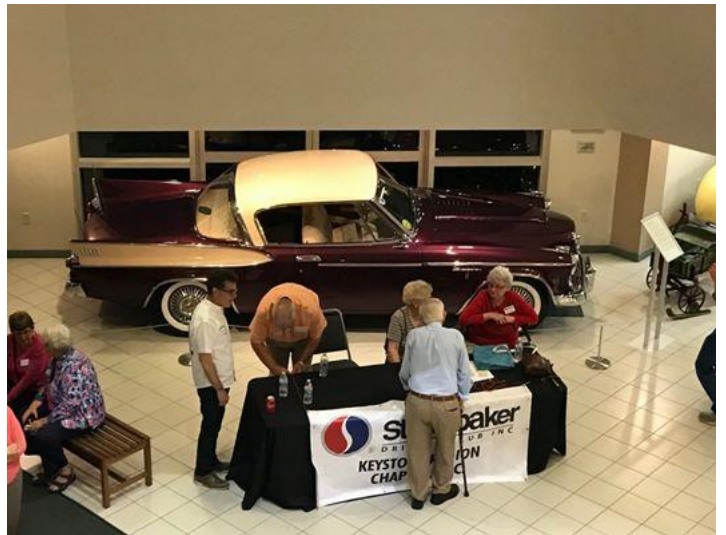
Registration Desk for the Museum's Studebaker Cool Event

The exhibit opening night program started at 5:30 p.m. until 6:45 p.m. with hors d'oeuvres and cocktails while enjoying the new Studebaker exhibit. From 7:00 p.m. to 8:30 pm were opening remarks and an overview of the exhibit followed by a 4-person panel program covering Studebaker history. The panel included an archivist from the Studebaker Museum in South Bend, IN, an automotive historian/author, a hawk expert /author and the event moderator who was an auto historian and writer. The exhibit included everything from early World War 1 era to the supercharged fiberglass Avanti sports car of the early 1960s. Also on display was a featured stylish Studebaker prototype, the SCEPTRE designed by Brooks Stevens, which was intended as the 1966-67 replacement for the Hawk. This was its first appearance in an East Coast museum. The SCEPTRE was a two-door hardtop with a horizontal light bar grille and taillight by Sylvania.