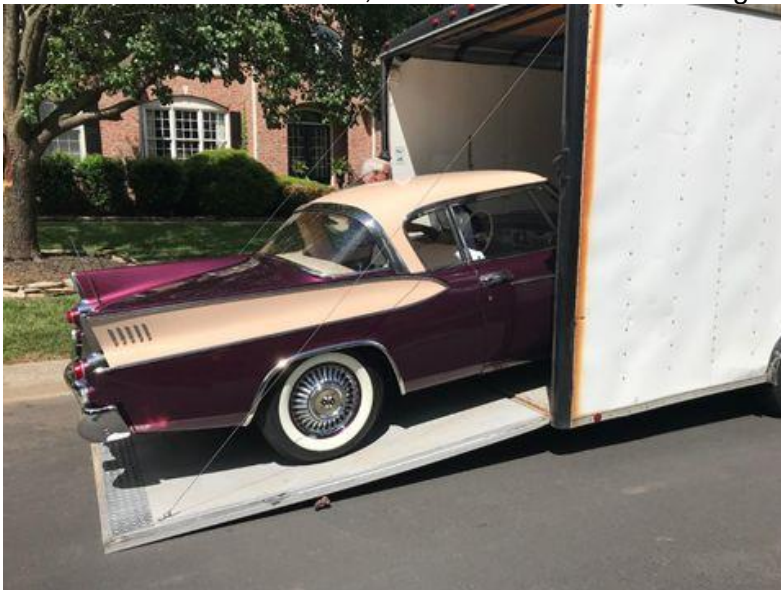
Loading the 1958 Studebaker Golden Hawk into the Museum Trailer in Raleigh

On May 13 th two AACA staff members arrived to pick-up the Hawk. It worked out perfectly as they delivered a car to New Bern, NC and then came to Raleigh for my car. The curator told me he would place the car in the display at the front entrance of museum lobby. Shortly after they transported my Hawk, I received an invitation to come to Hershey for the exhibit opening celebration on May 17 th . The invitation went to 350 people mostly car owners having their Studebakers on display plus members of the Keystone Region Studebaker Club. I arranged to fly into Baltimore, MD to have my grandson who lives in Baltimore to meet me and together we would drive to Hershey. He was excited about the offer to visit the museum and of course to see the many Studebakers. We arrived the afternoon of the 17 th and stayed at the hotel next to the museum. I could not wait to enter the museum, so I left early and sure enough, there parked in the entrance lobby was my Golden Hawk in the window of the lobby.