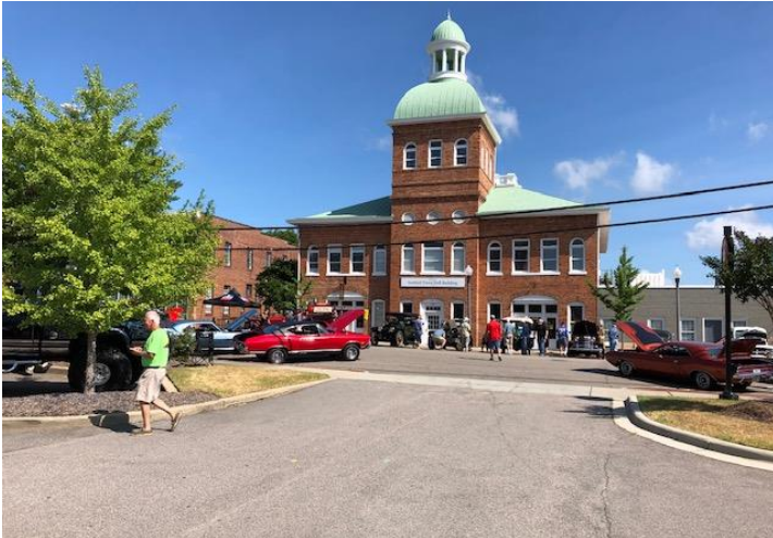
View of the City Municipal building on Charlotte Ave. (Dan Fuccella's Willys at right edge of the building)

show had many different vehicles from last year and there were more HPOF and DPC vehicles. There was a wide range of very old and new vehicles on display. San-Lee Chapter had door prizes and awards for most all the participants.