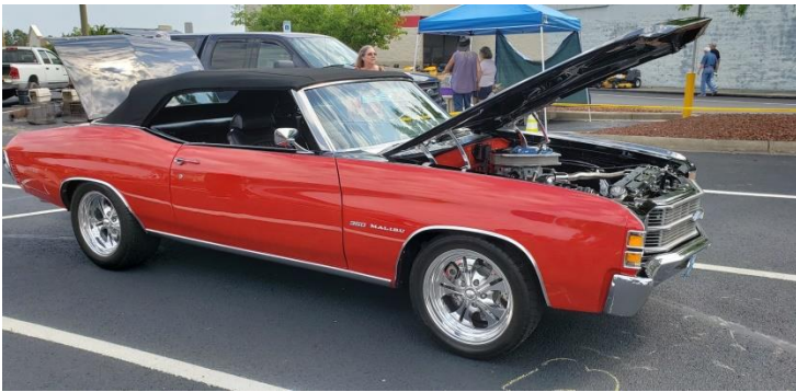
Like my first car, except mine was a 1965 4 Dr

We encounter a bit of traffic on I-40, it is Memorial Day weekend after all, surprising us as we are headed away from the beach. Eden is located north of Greensboro. The Car show was in the parking lot of the Tractor Supply Store. Upon arrival we are ushered into a spot # 46. More cars arrive after us. Overall about 70 cars were in the show. Our Avanti draws a lot of interest. Many, thinking it is a foreign car, are surprised to learn it originated as a Studebaker.