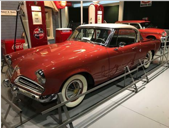
1953 Raymond Loewy Studebaker Starliner