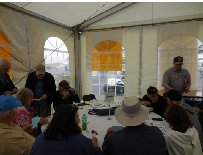
The Judges Breakfast