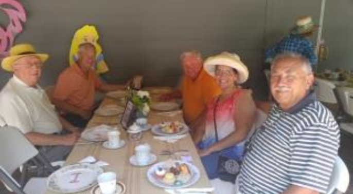
2018 Wake Forest Display