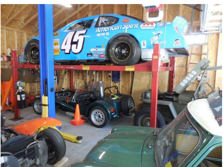
Some of Joel's car collection