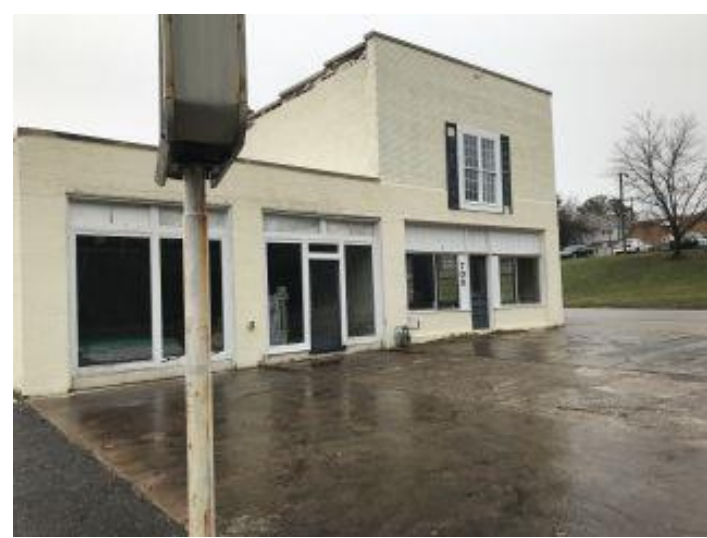
The former AMC Dealership.

While we were in Spencer we took time to have look at the new properties that the Transportation Museum is acquiring just down the street. See the pictures below. These two buildings were an AMC car dealership many years ago. The museum plans to use these facilities to display and service the cars and trucks which have been donated.