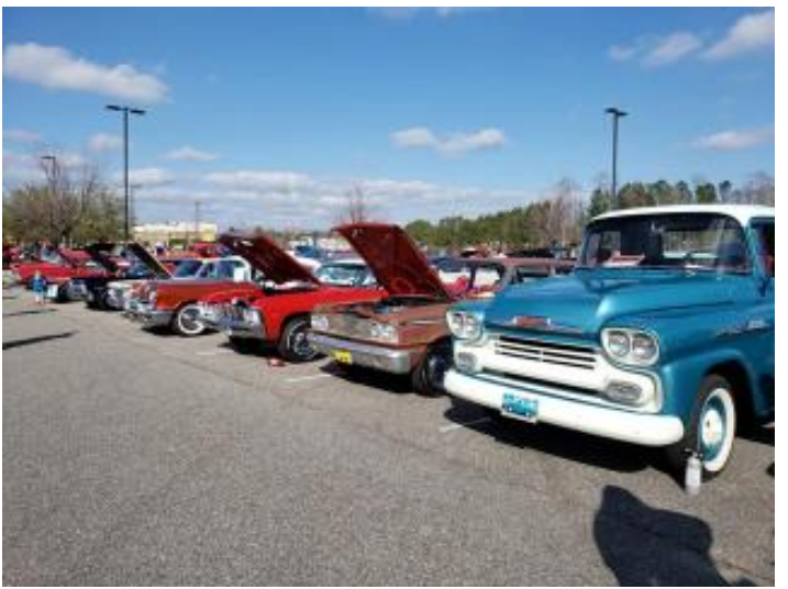
Some of the Cape Fear Cars on the Show Field