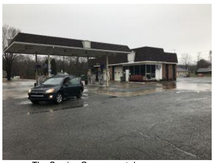
The Service Garage next door.