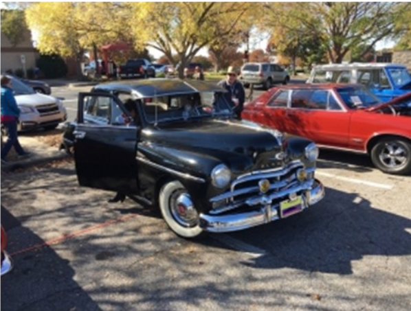
Roger Lopera's '50 Dodge