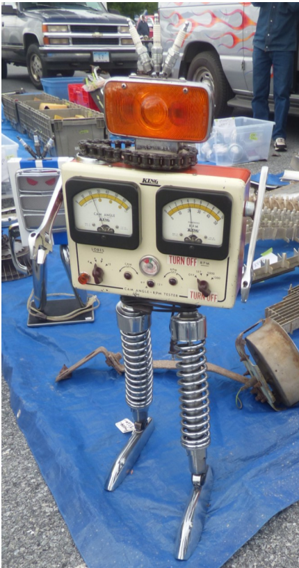
This robot was just adorable and for sale in the flea market.