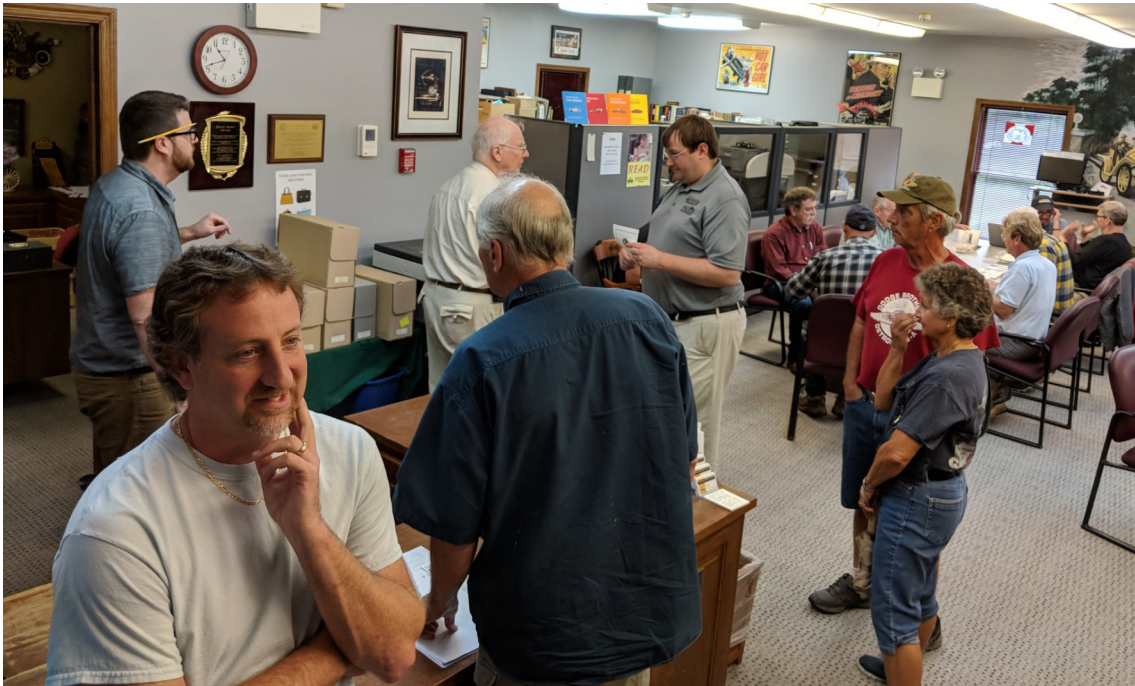
The library was very busy on Thursday!