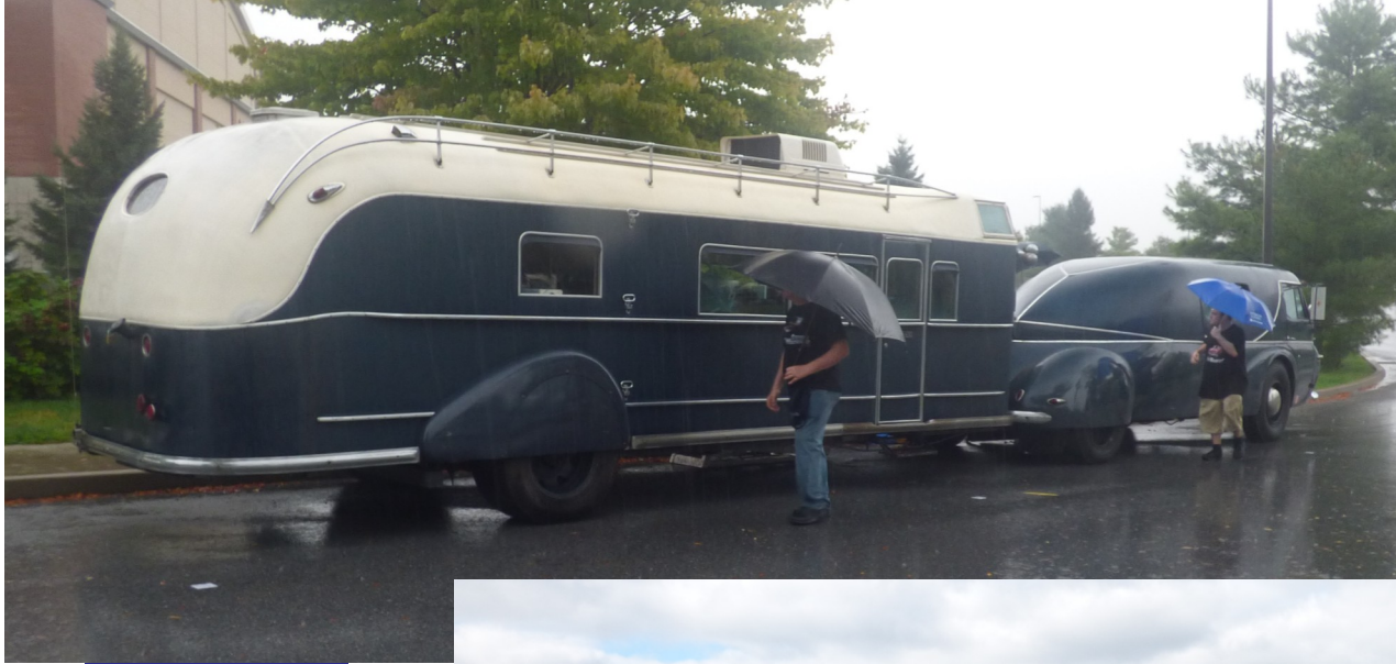
1938 REO Pilot car and trailer. Such an amazing and unique vehicle!