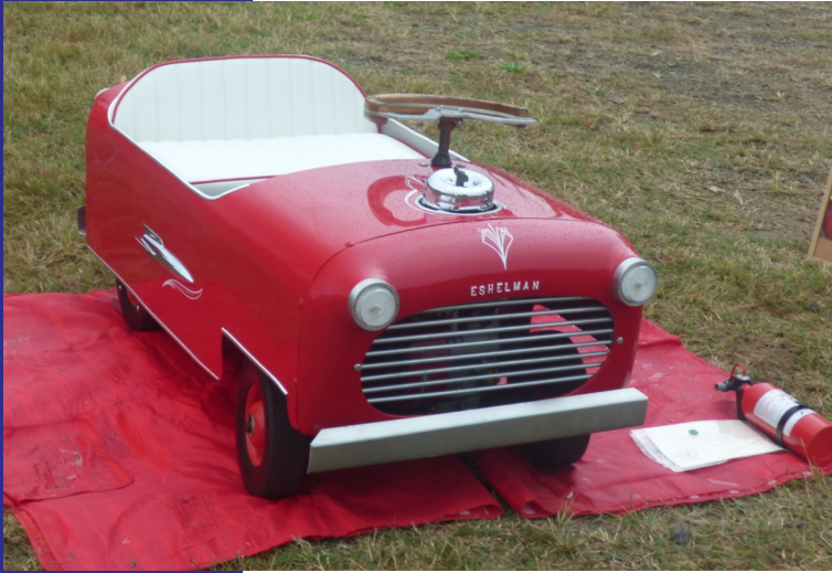
This is a 1953 Eshelman Adult Sports Car! Yeah, we had the same reaction, but man was this a nice little, err, car!?