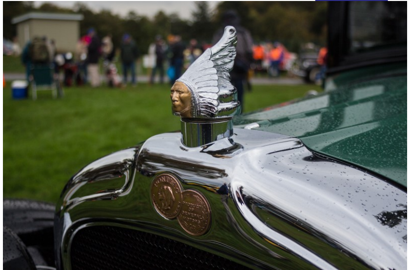
Pontiac Radiator Cap