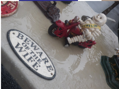
This sign make me laugh out loud!