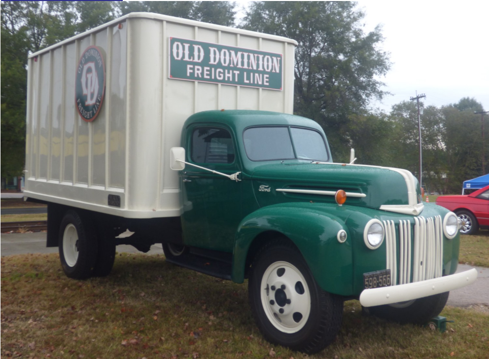
Check this moving truck out! It was beautiful and it won the Lester Brown Memorial trophy for trucks 1 ton or larger.