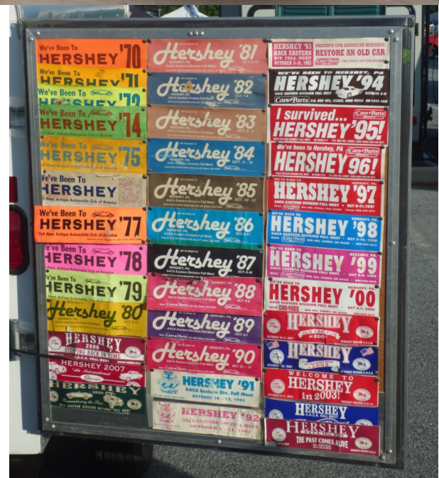
I think this man has been to a few Hershey meets!!