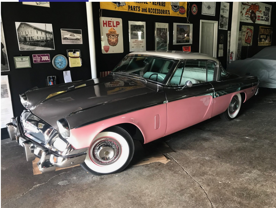
"Barbie" getting cozy in her new home

I enjoyed another Hershey fall meet and this year will be memorable. It's always great to win an award at Hershey but this year I actually sold my 1955 Studebaker Speedster to a collector friend who has a garage in Hershey. ( I know the car went to an owner who loves the car and will give it a good home in his multi car collection including several other Studebakers.)