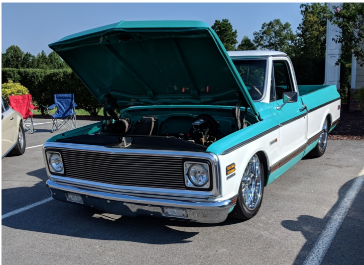
Some of the beautiful vehicles.