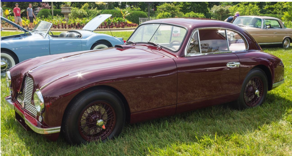
1952 Aston Martin DB2 Sports Sedan