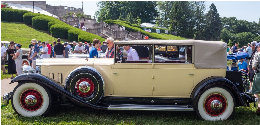
1932 Packard Twin Six