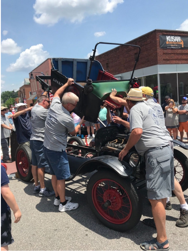
The Take-A-Part T Team in ACTION!