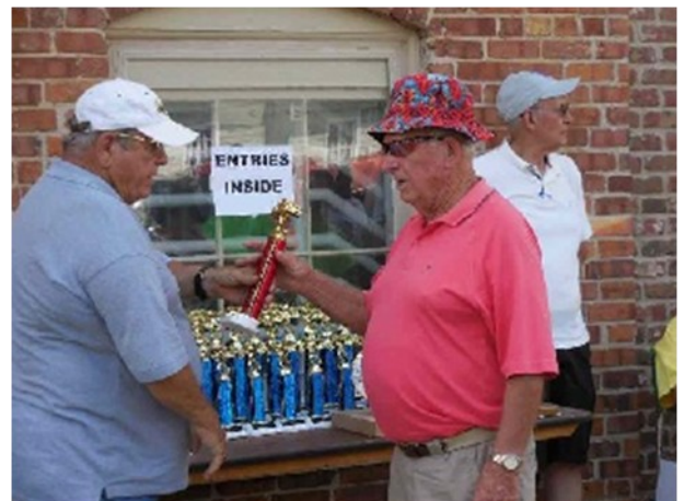
Award presentation in the shade