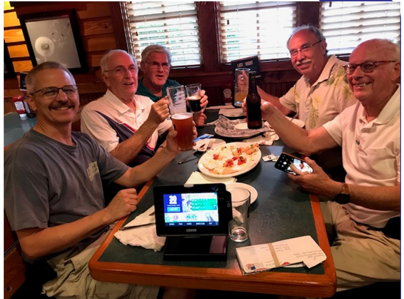
Smokey Joe's Rib House Gathering