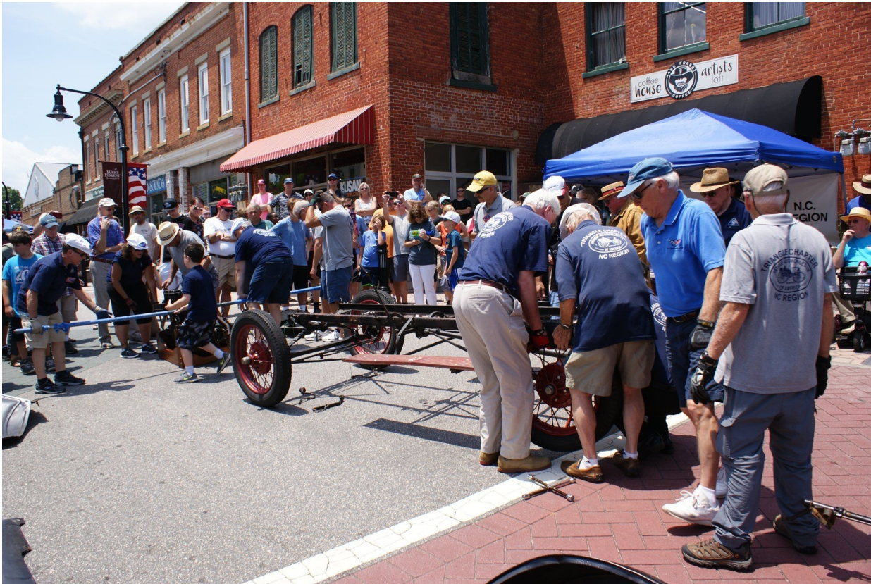
Getting ready to carry the engine over