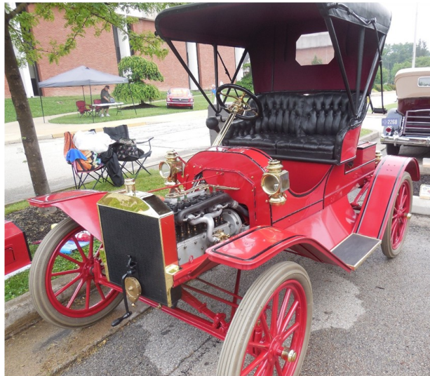
1908 Ford Model S owned by Ed Roth

Next morning the weatherman just had to dampen the atmosphere with a light mist just to make it difficult. Bob and I left for the show field and found the route to be completely void of any directional show signs except one (Problem #1). We arrived at the "Spectator Parking" lot around eight am only to find the approximate limit of fifty cars had already been absorbed (Problem #2). We were told to continue on to the trailer parking to find a spot on the fairgrounds (Problem #3), no rhyme or reason on parking location, pick your spot and leave for the transfer bus (Problem #4). Finally arriving on the show field we immediately found Joe in position prepping for display.