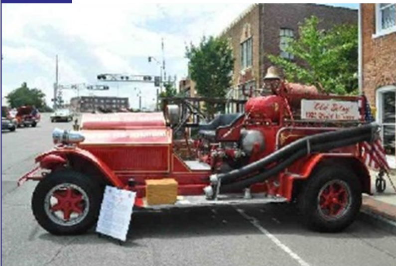
Sanford Fire Truck on display