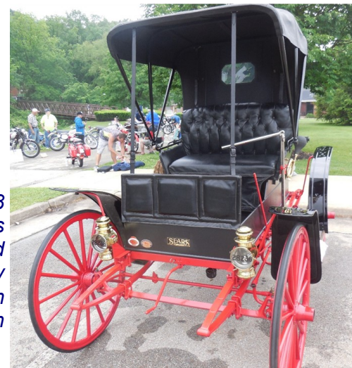
1908 Sears owned by Norman Hutton

started a century old tradition of ordering a car out of a catalogue?