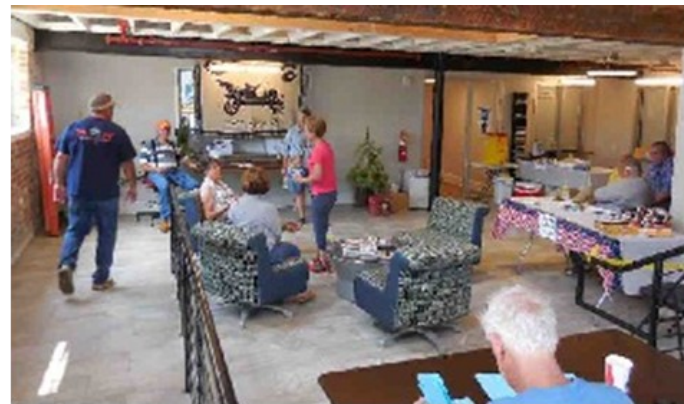
Air conditioned registration