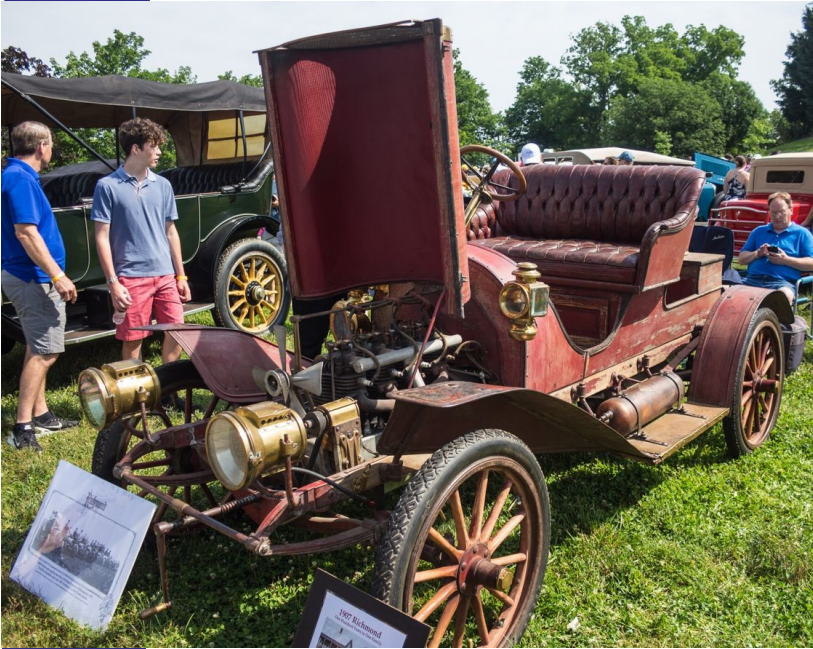
1907 Richmond Model J1