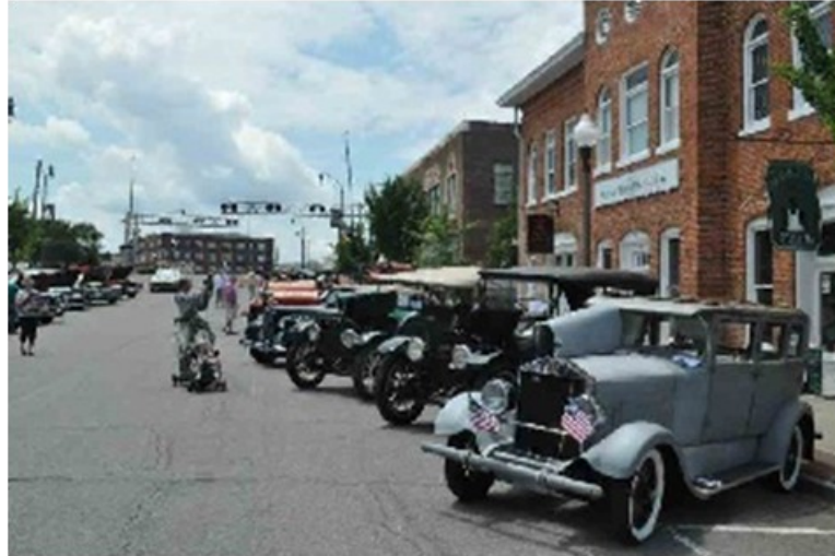
Cars displayed on the side street

The San-Lee Chapter held their car show on June 2, 2018 in downtown Sanford. I was the only Triangle Member at the show due to others being at the AACA Grand National meet or other car shows. San-Lee had to make some adjustments including moving the venue to accommodate local merchants and moving registration inside the remodeled Buggy factory now serving as the offices for the City of Sanford. Both changes worked out well. They had 79 vehicles entered in their show with AACA classes and open classes included. The owners provided many interesting vehicles to look at and lots of spectators enjoyed looking at the cars and talking to the owners. The weather cooperated with Lee County "very warm" weather and no rain until after the show. San-Lee had many door prizes and awards for all participants. Thanks to the San-Lee Chapter, Bennie Pokemire, President and Anthony and Teresa Bright Co-Chairs for a well organized and enjoyable show.