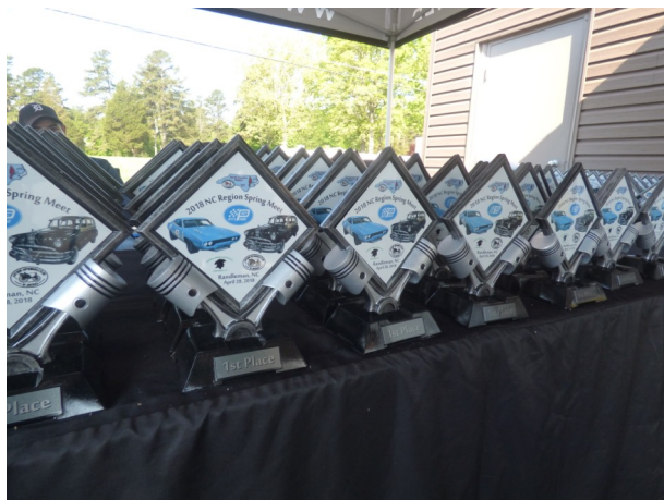
The trophies on display.