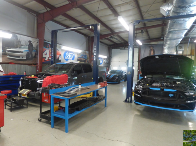
A brand new F-150 and Mustang receiving the "warrior" treatment.