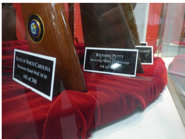
Rifles are all #43 of their collection.