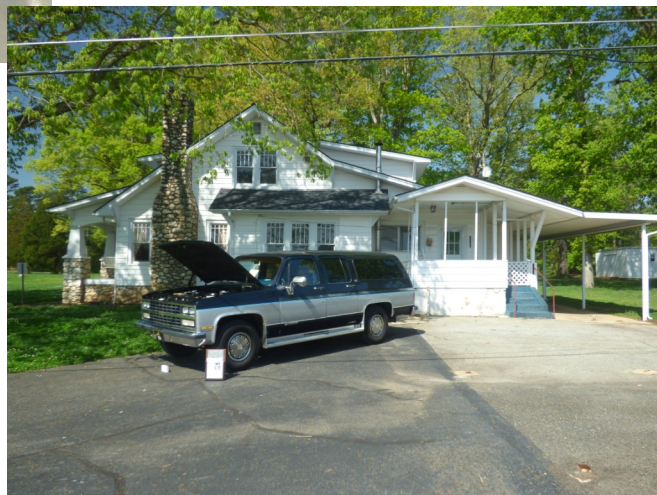
My Burb parked in front of the original home of Richard Petty, now a historical landmark.