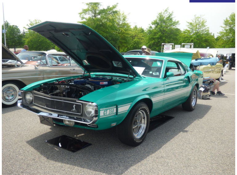
v Best in Show—AACA