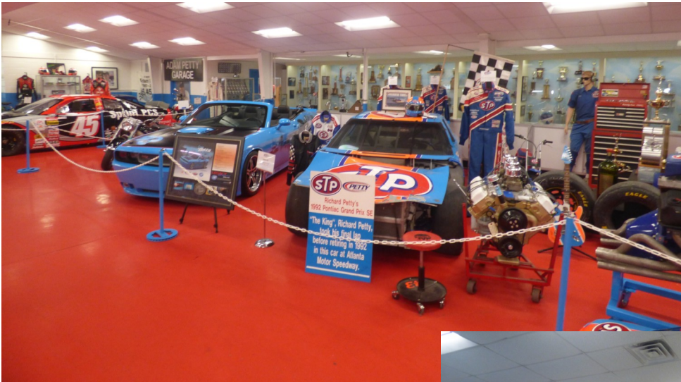
The second building housing many race cars, engines, and other memorabilia.