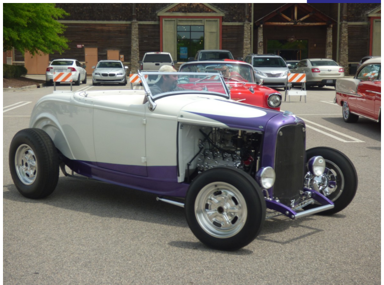
^ Best in Show—Modified