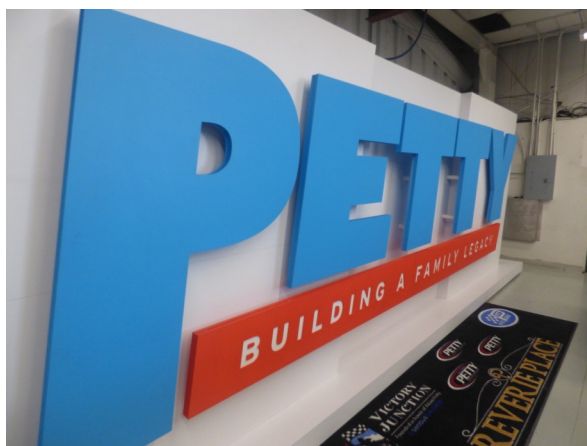
One of the many signs reminding you of where you are around the shops.