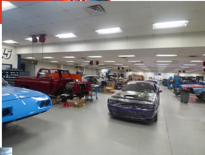
Inside the performance shop. I see lots of vehicles I'd like to take for a ride!