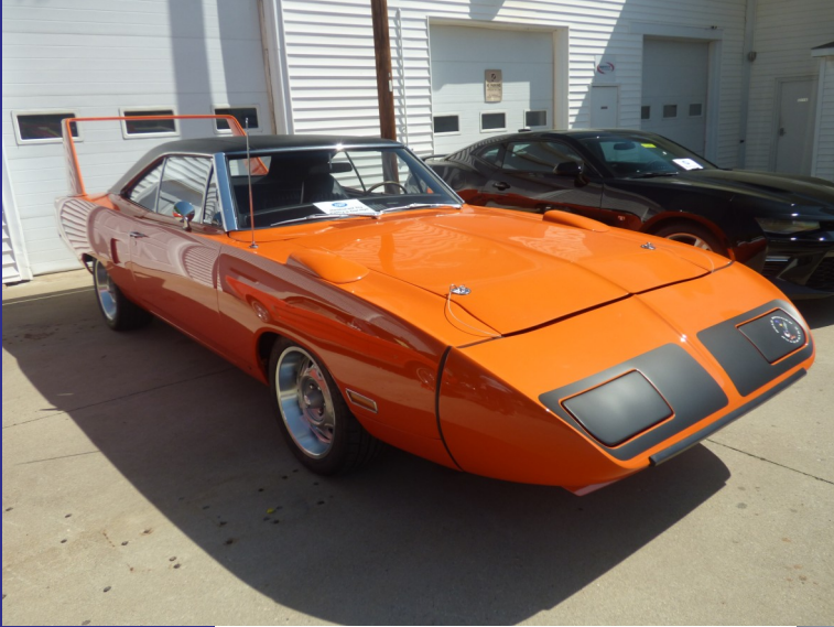
Some of the beautiful cars ready for judging.