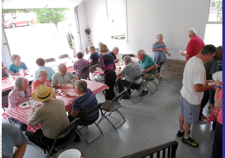
Members enjoying the wide array of chili, cornbread and desert!