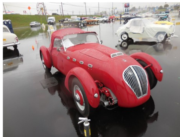
1950 Austin Healey Sprite

Then we walked through some of the other car club displays under the grandstand where it was dry. Eventually we ventured out to the flea market hunting elusive parts. Over 50% of the vendors were already gone. Vendors had good days on Thursday and Friday, but left to avoid the heavy rains. There were many empty vendor spaces and puddles. I tried unsuccessfully the purchase a few things from one vendor in the green field who really did not want to get out his pickup truck to show anything under his tarps. I came away with one piece of wet aluminum trim for $20. The only other things we purchased were an expensive $3 coffee and a $5 bottle of Sprite.