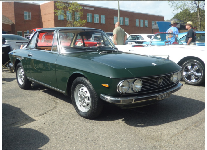
His Lancia was beautiful! One of very few foreign vehicles.

Here are some vehicles from the show. To view them all, please copy and paste this link into your web browser: