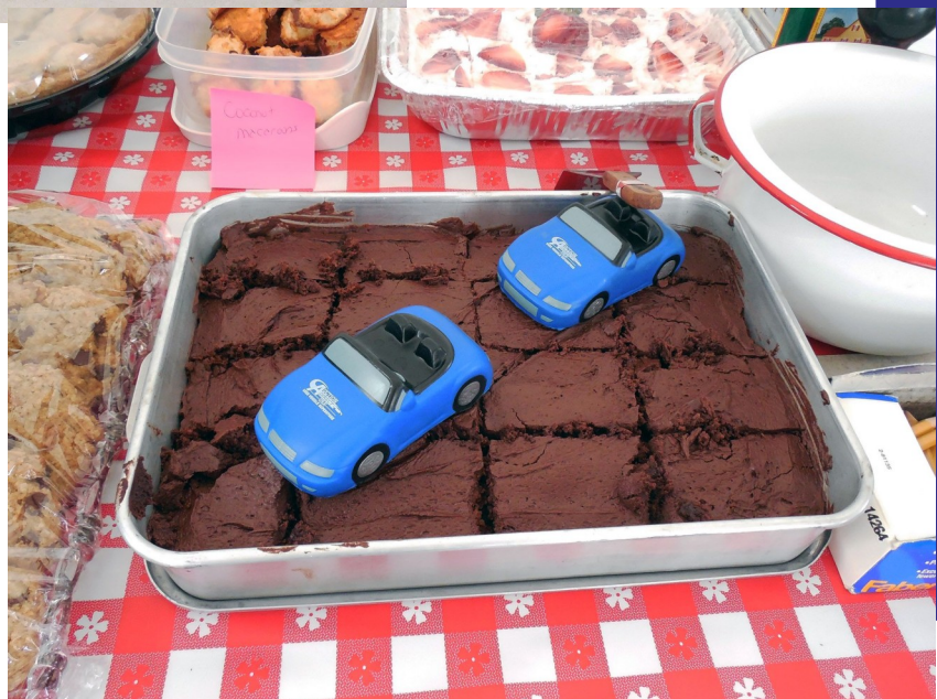
Les Tryon's "Car Cake"