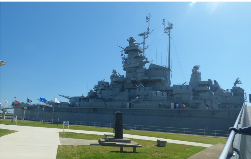
The USS Alabama Battleship .

Once the cars were judges, the judging teams turned in their paperwork, making sure no car was forgotten. Information was checked, double checked and uploaded to National's database, reports were then printed out for the banquet tonight. What an experience to be able to watch, assist, helpout and see all the the goings-on behind the scenes of a National Event while on the judging field. Now to get some rest and get off of my feet. (My pedometer counted 12,254 steps Saturday alone!)