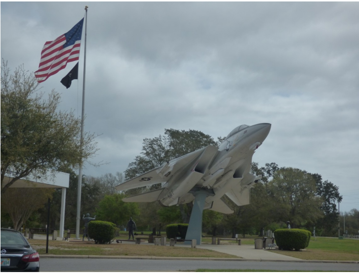
These beauties greeted us at the entrance to the Naval Air Station Museum.