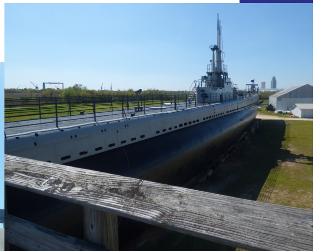
The USS Drum Submarine