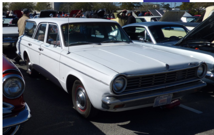
Chet Butcher's Ford