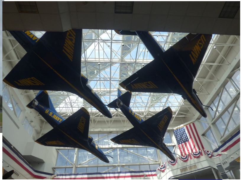
Four Blue Angels jets hang together inside the Museum.

We continued on into the second building after walking underneath four Blue Angels jets hanging from the ceiling above! This building was much of the same as the first - planes planes everywhere! But here, there were trainers that you could sit in and take photos while in the cockpit of a fighter jet. There was an Air Force One Helicopter and US Coast Guard aircrafts in here, as well as memorials to Vietnam, the Forestal - which had a horrific disaster on board - and the Oriskany which was sunk in the ocean to make a new reef. This was truly a remarkable place to visit and learn about so much history in a fun way.