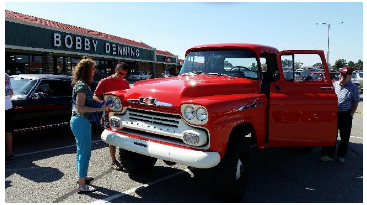
A 1958 Chevy Pickup with a NAPCO 4-Wheel drive option. This was his father's pickup which was fully restored