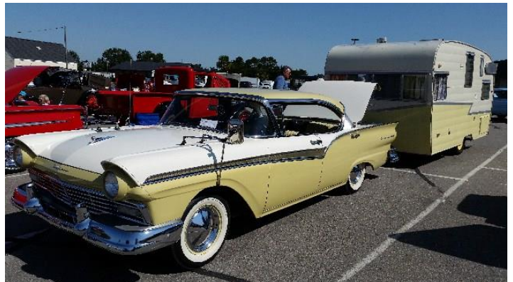
The owner bought the trailer first and then found the 1957 Ford 4-door hardtop to match three months later. One fellow said it reminded