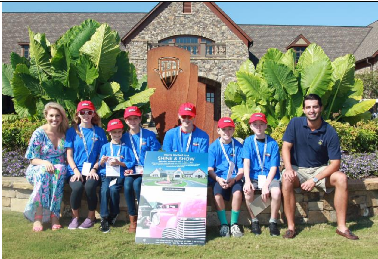
The Kids Judging Team at Hasentree