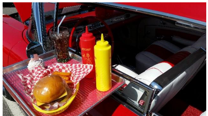
A Drive-in Display