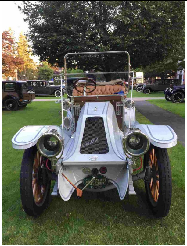
The Oldest Franklin at the meet was a freshly restored 1911 Franklin