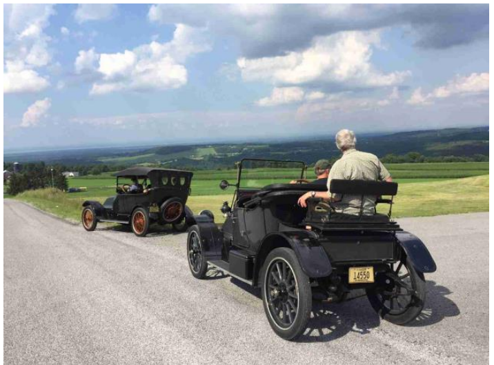
The Franklins on tour in the New York state country side.