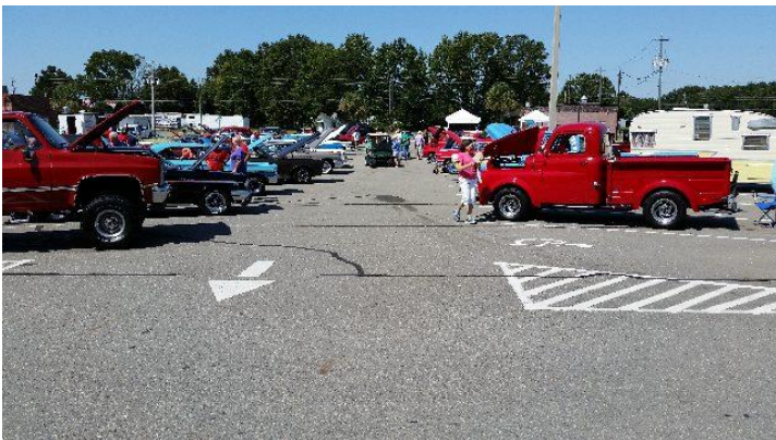
The show field