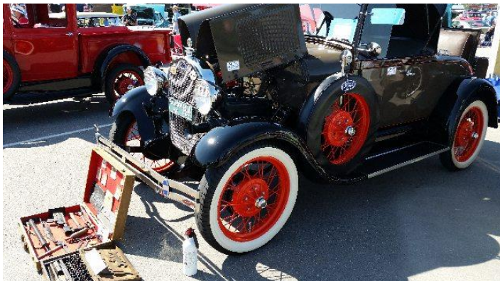
A Model A with a complete set of tools including square sockets

There were 62 cars registered for the event. The Chapter was competing with another open show in nearby Goldsboro. This was an open show so there were many modified vehicles. There were also many newly restored cars and trucks that were not there last year. They awarded plaques to all the winners. Below are pictures with captions of some of the cars and trucks at this year's show. More pictures on the Region Web site.