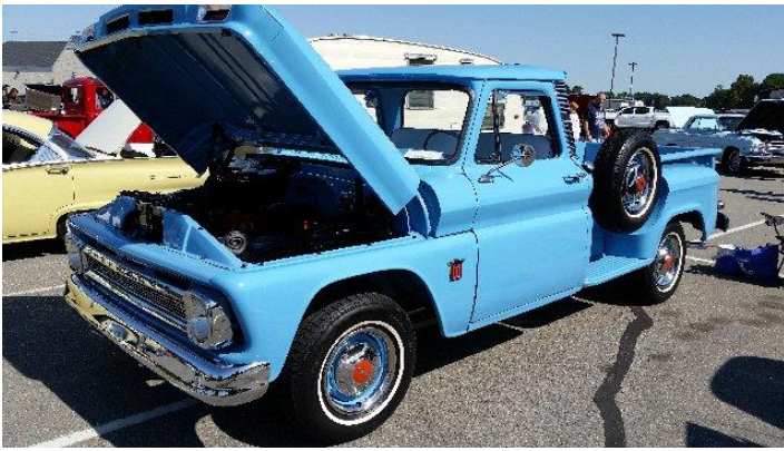
A beautifully restored 1966 Chevy Pickup