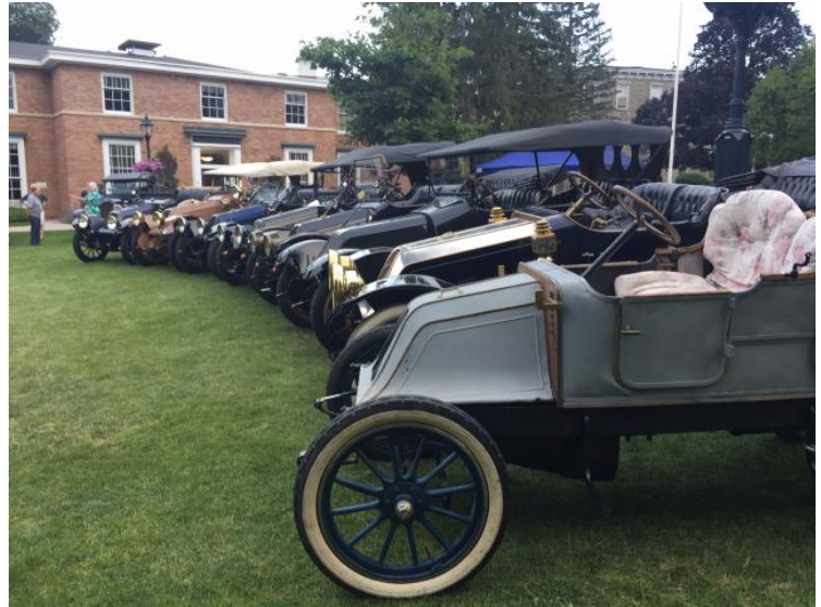
These Franklins at the meet were all 100 years or older vehicles. Most of these vehicles were also driven on the 100 mile round trip tour.