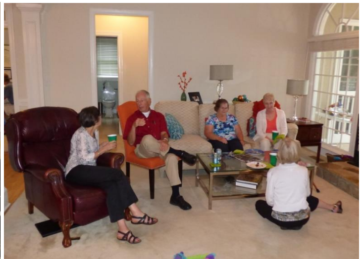
Members catch up with each other after enjoying a delicious meal.