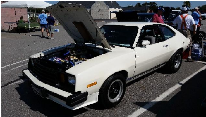
A Pinto with a 530 HP engine.