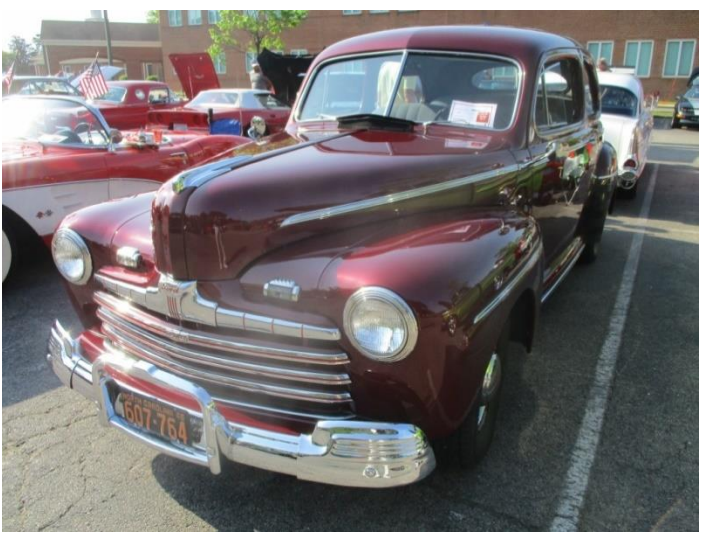
1946 Ford Sedan owned by George Woods