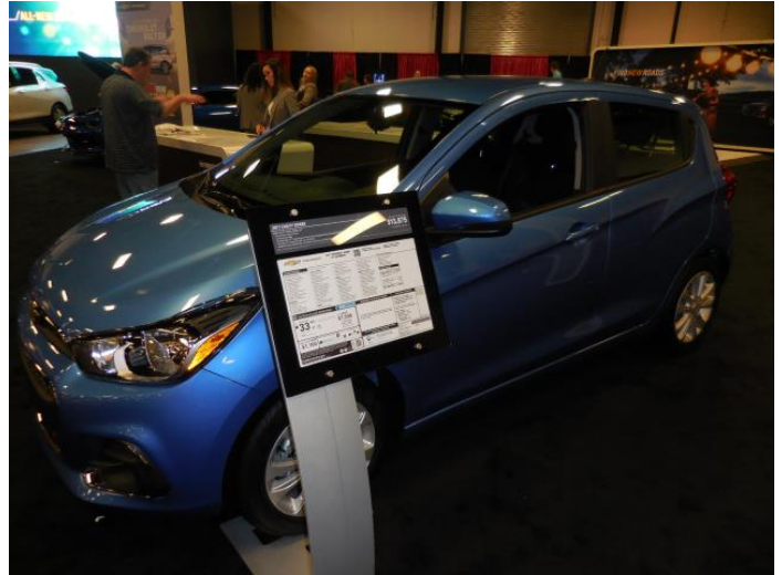
Low Price of the Show - 2017 Spark $13,875