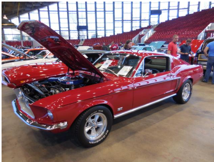
1968 Mustang 390 4Speed