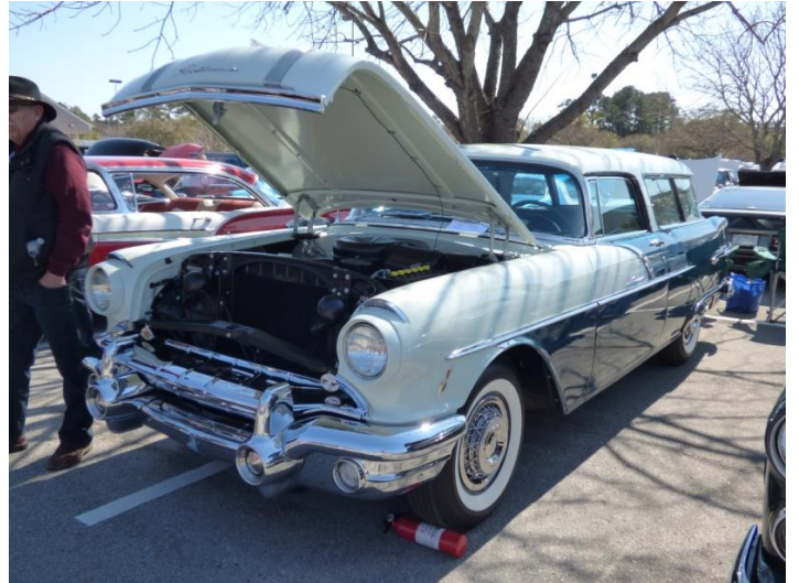
Warren's Pontiac Safari

Click here for photos: https://goo.gl/photos/mqrqJjVCWppGGTv7