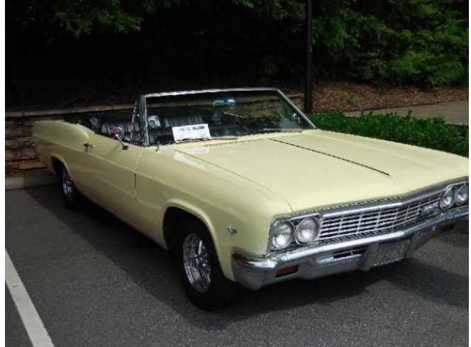
Carl and Linda Worstell's 66 Impala First NC show