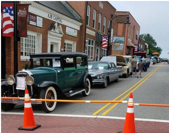
The first Entrants were Dean and Les Tryon