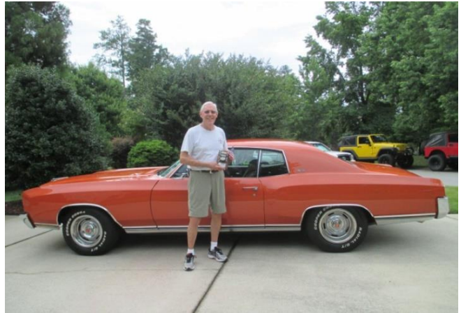
In 2017 with his AACA National 1st Senior