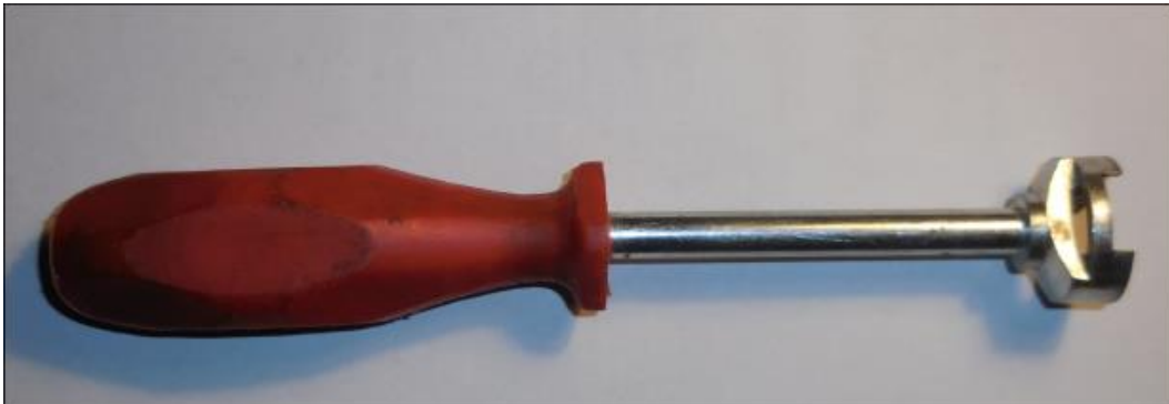
July Mystery Tool

We have not been too successful with getting you to spring into action and answer the mystery tool questions. So this month we will give you a break and make it a little easier. What is the purpose of the tool shown below? Can you name the four parts it is used to configure? If you have answers to these questions, Email Denny at OestreichD@AOL.com