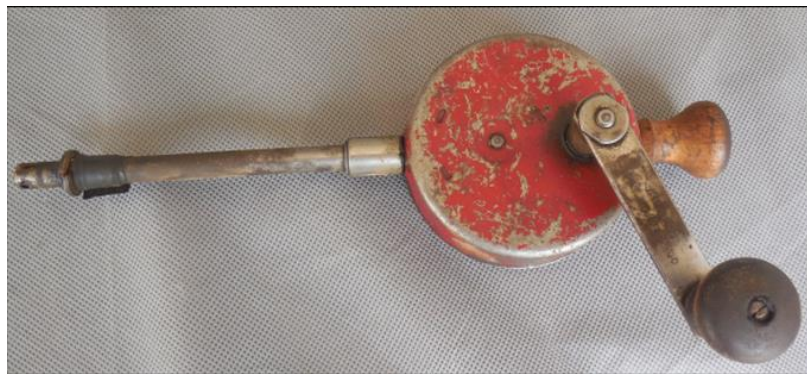
August Mystery Tool

The August mystery tool was submitted by Jim Gill. The tool has a specific purpose. To make the contest a little more difficult, you must identify: 1. The purpose of the tool, 2. The important missing part of the tool, and 3. The rotation reaction of the end of the tool to turning the crank. If you have an answer for this mystery email Denny at OestreichD@AOL.com.