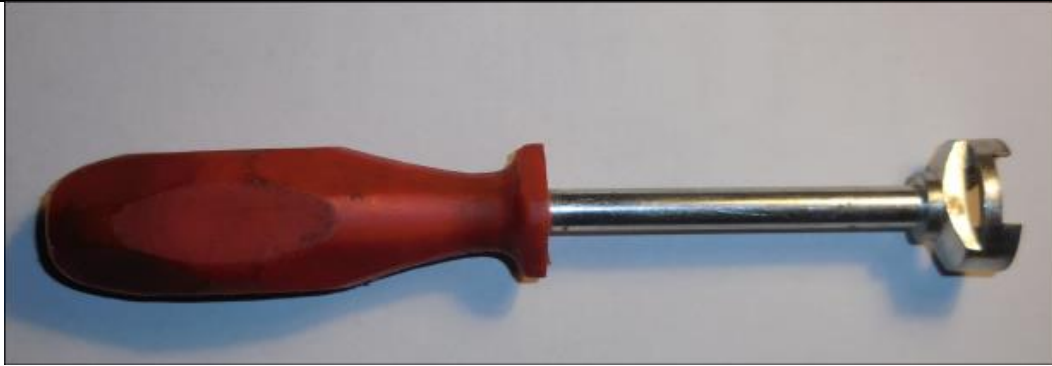
July Mystery Tool