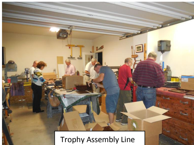
Trophy Assembly Line