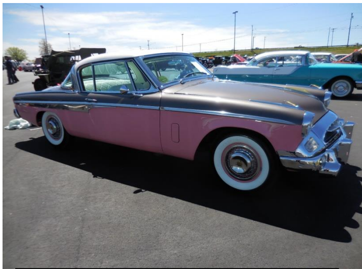
Joe Parsons' 1955 Studebaker Speedster 1 st Show