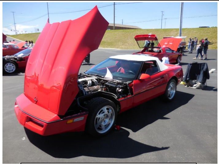
Rob VanDewoestine 1990 Corvette