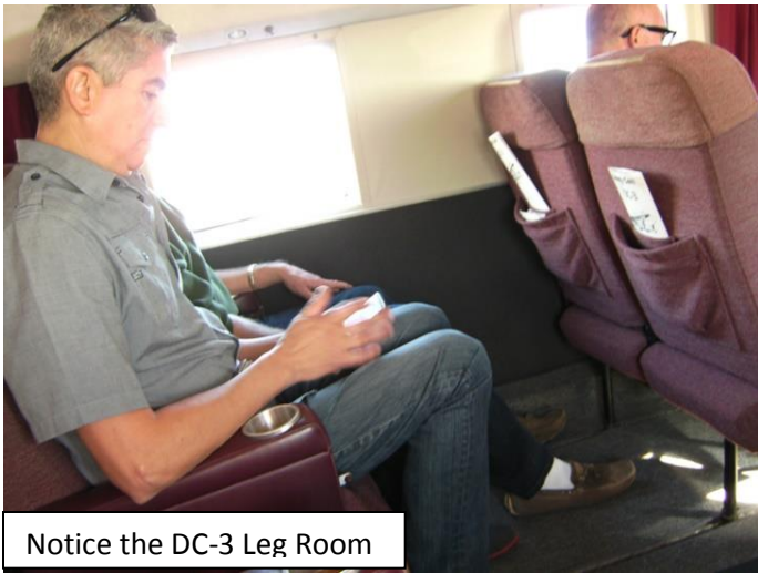
Notice the DC-3 Leg Room