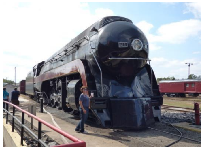
Annie with a 1950 Steam Powered Locomotive

Pictures from the show: https://goo.gl/photos/rJao1aYm34rGUSdv8 Pictures from the museum: https://goo.gl/photos/XyZf5DgpuaFC5zsC7