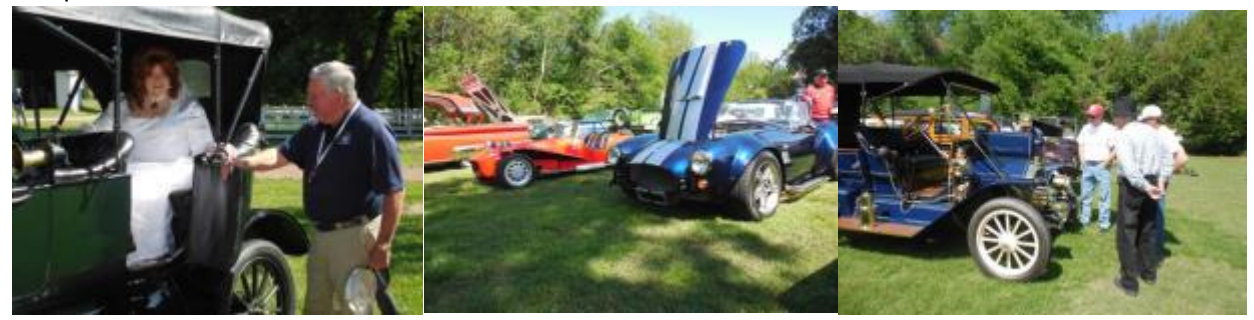
At 12pm, the Take-A-Part-T team showed off their skills at assembling the 1917 Model T in just over 8 minutes. Not the fastest time, but respectable since the team hadn't practiced since October. We will do better at each event.

As the cars were settled into their spots, some getting slightly stuck in the soft grass, spectators walked the aisles to enjoy the vehicles and talk car stuff! Riley Reiner was even asked to have his car used in a bridal portrait! There were several photographers out photographing families, our cars and trucks and one even brought out models dressed in a zoot-suit and flapper dress to model with some of the antiques.