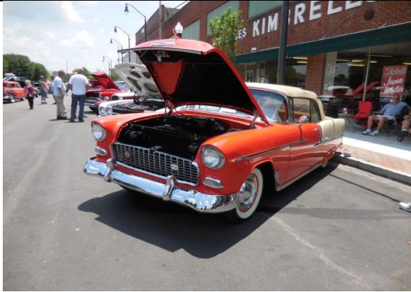
Floyd Barnes' 1955 Chevrolet