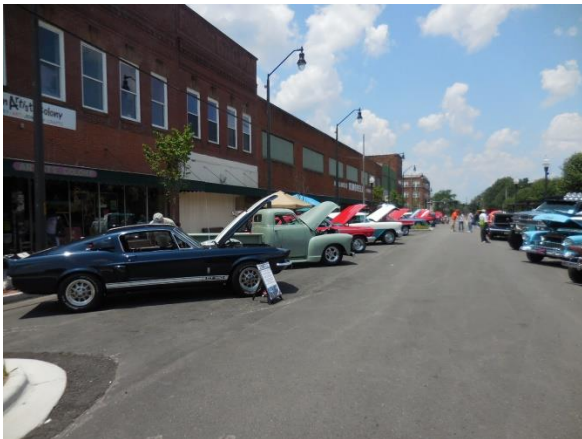
The Street Scene

The San-Lee Chapter collected door prizes and each of us in the Triangle Chapter received one.