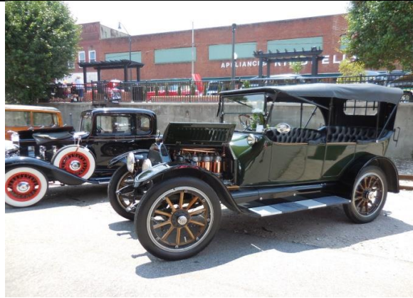
1932 Ford and 1916 Cadillac