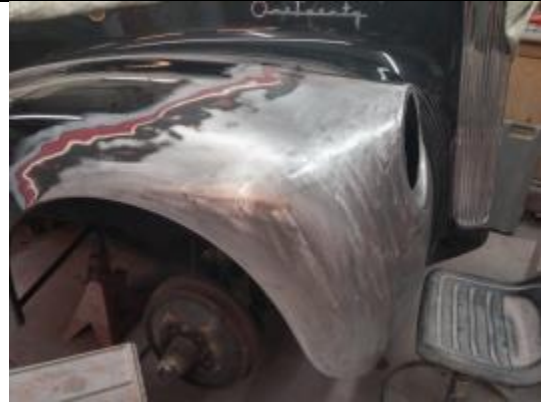
Under Repair (Side)