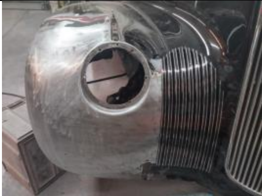
Under Repair (Front)